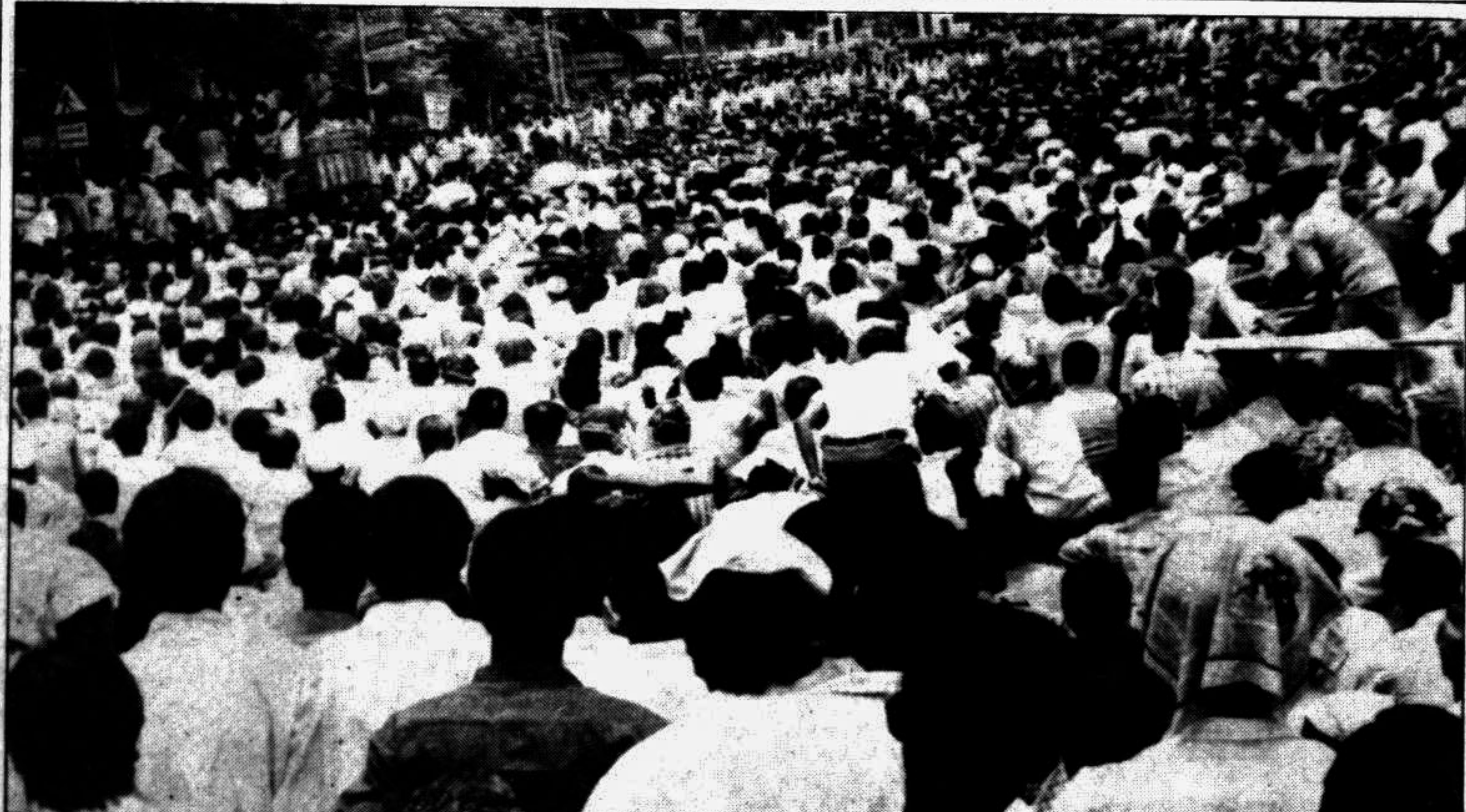
Class Four government employees demonstrating for implementation of Pay Commission report in the city Tuesday.