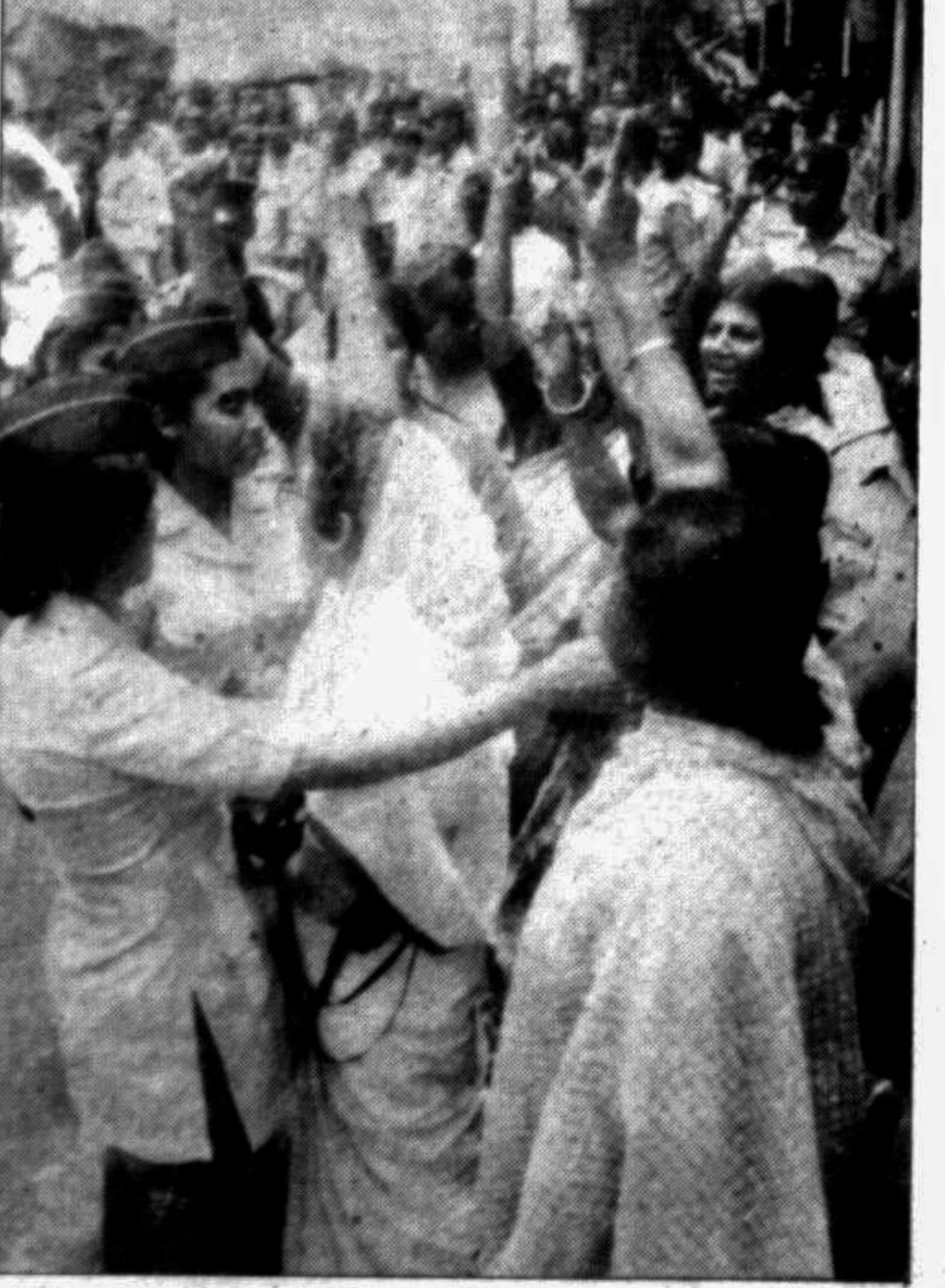
JP women demonstrating outside the court trying Ershad Tuesday.