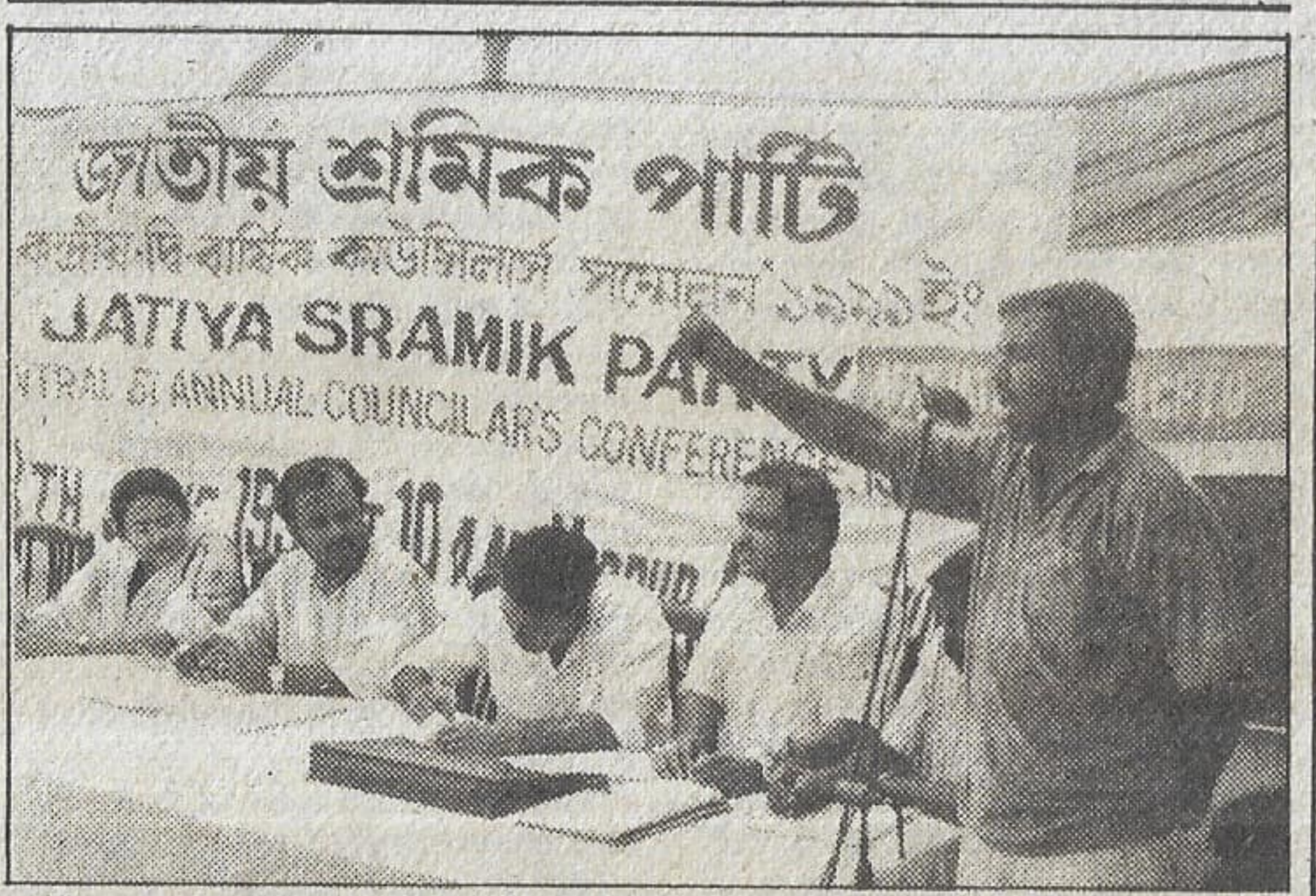
The central biennial council session of Jatiya Sramik Party was held at Mirpur recently.

She proposed that parent teachers association can also