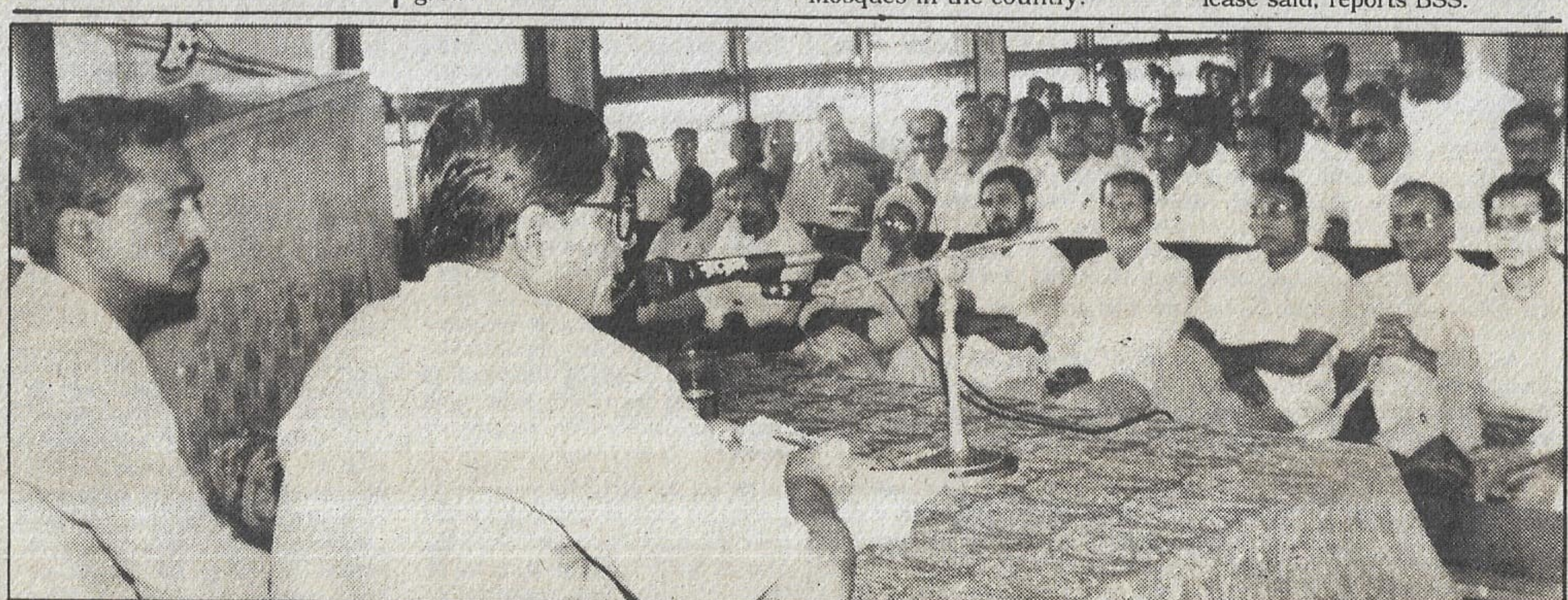
Dhaka University Officers' Association went on strike on Monday to realise their demands. The office-bearers and members of DUOA met at TSC to decide on future action programme.