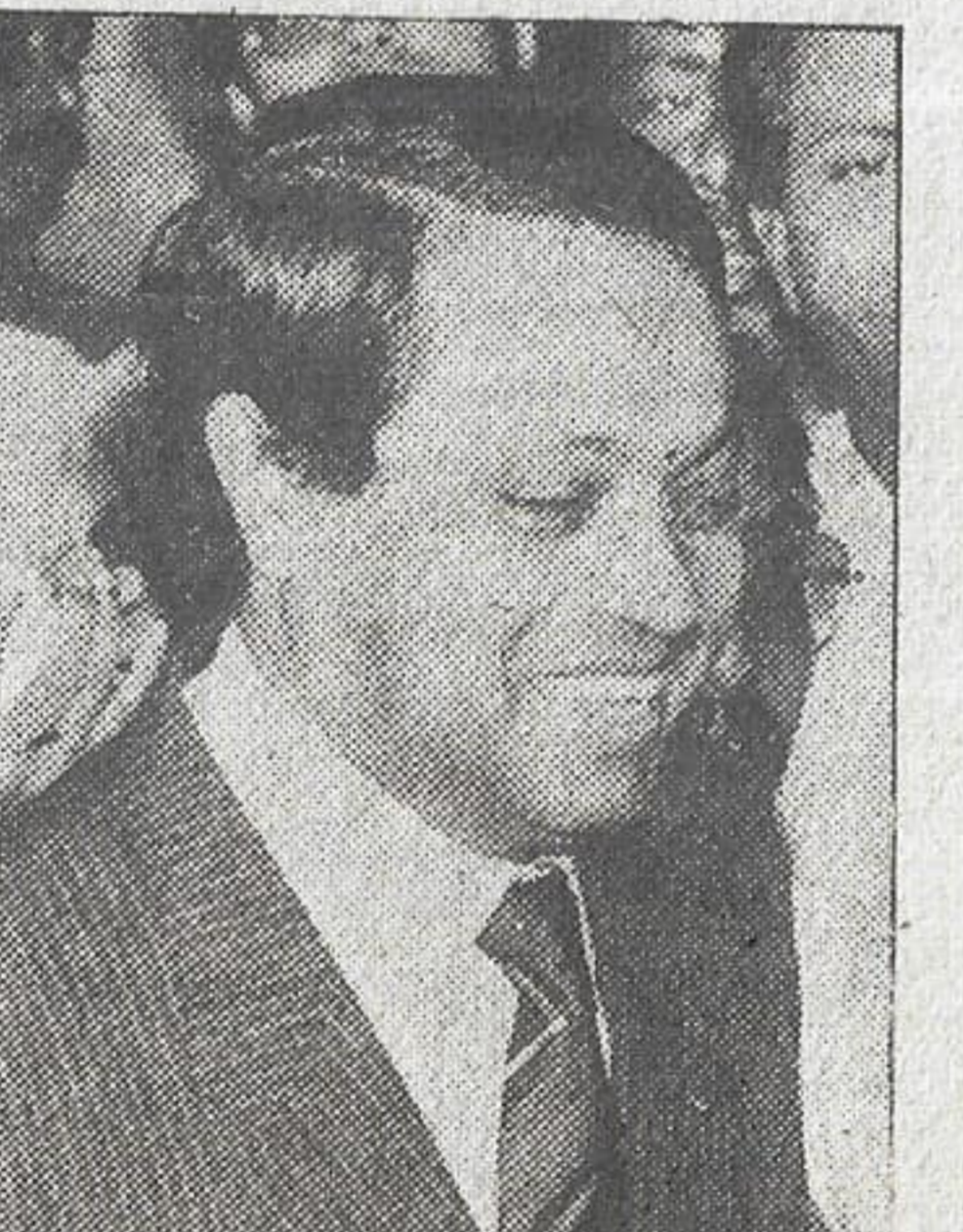
Moudud Ahmed Barrister Moudud Ahmed, the Jatiya party leader, then