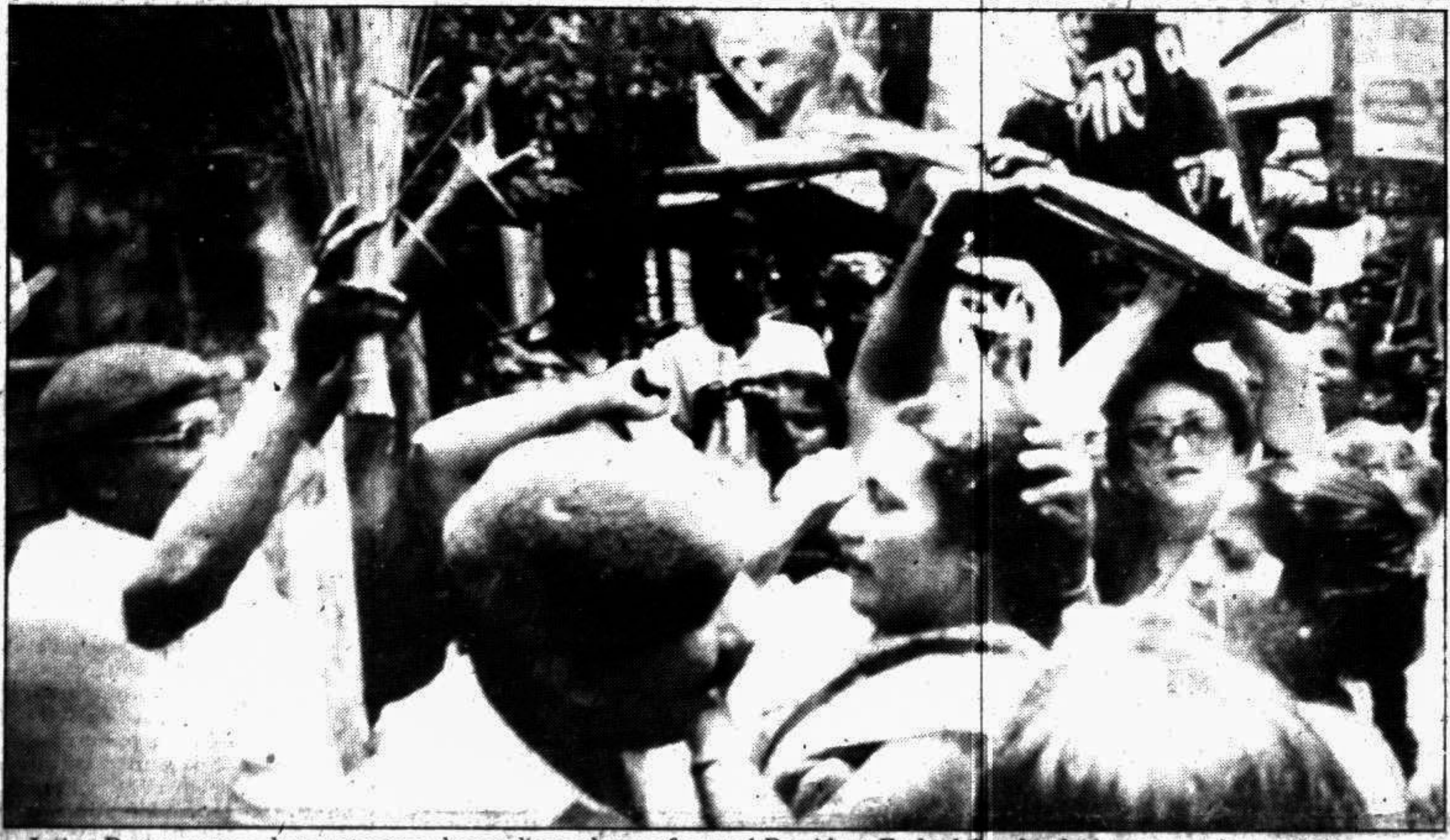
Jatiya Party women demonstrators demanding release of ousted President Ershad Sunday lash out at police with brooms in front of the residence of Attorney General Aminul Haque, prosecuting the ex-President.

Government has deferred launching of Dhaka Electric Supply Authority (DESA) by two months, reports UNB. DESA, scheduled to be launched July 1, will now go into operation September 1, Energy Ministry sources said Sunday. The World Bank, which has been pressing hard for early launching of DESA, was informed of the latest decision last week in a letter by the Economic Relations Division (ERD). DESA was initiated at the suggestion of the World Bank, the largest fund supplier to the power sector, to reduce unabated system loss by separating distribution from generation. See Page 10 Col. 1