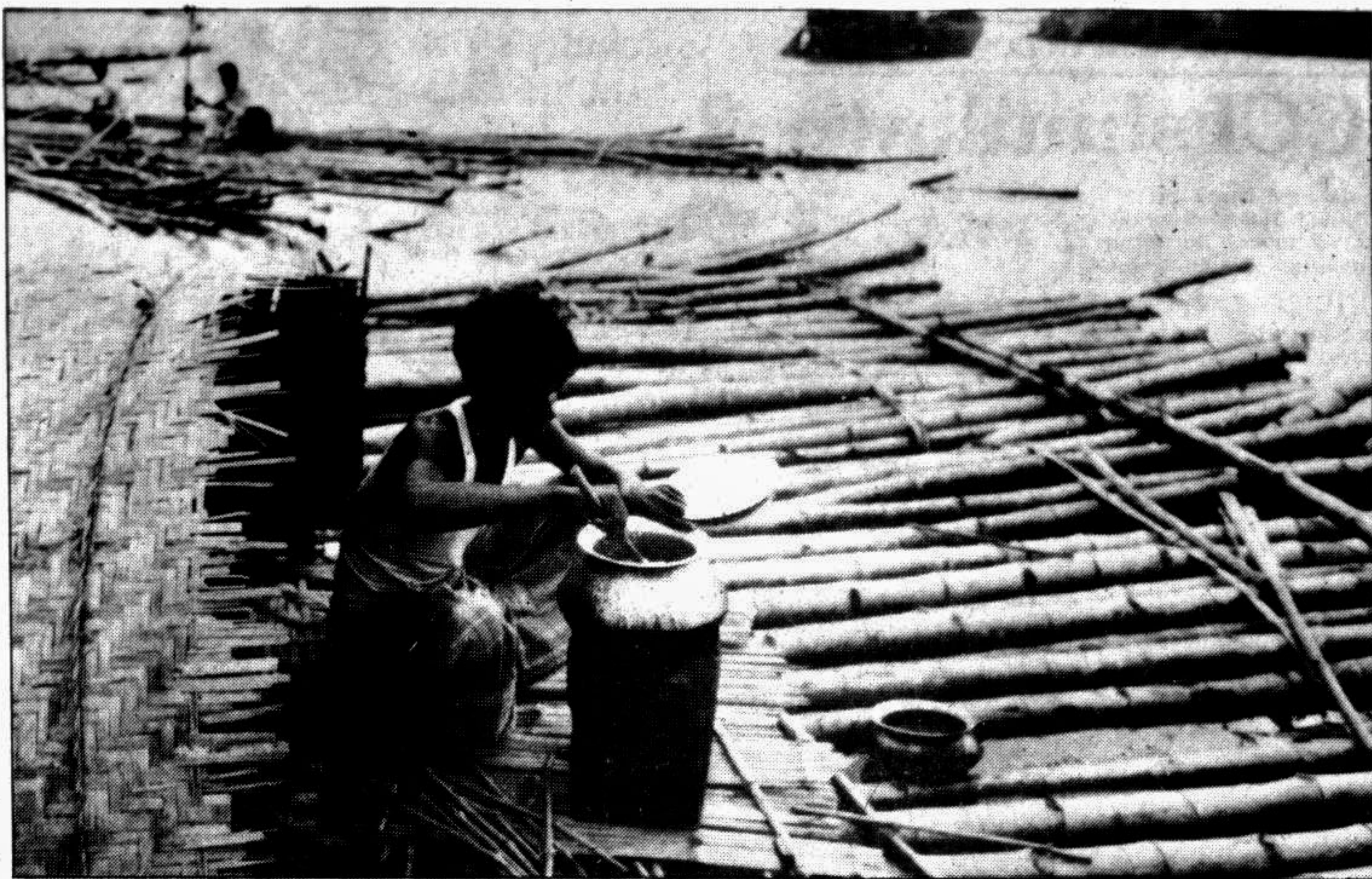
Bamboo, an important house building material is widely used in rural as well as urban areas. Though the owners of bamboo clusters do not get the fair share, the retailers earn considerable profit. Here a salesman busy cooking his day's meal on the makeshift house on a bamboo raft in the river Sitalakhya in Narayaniganj.

He was 70. He left behind three sons, 4 daughters and a host of relatives and friends to mourn his death.