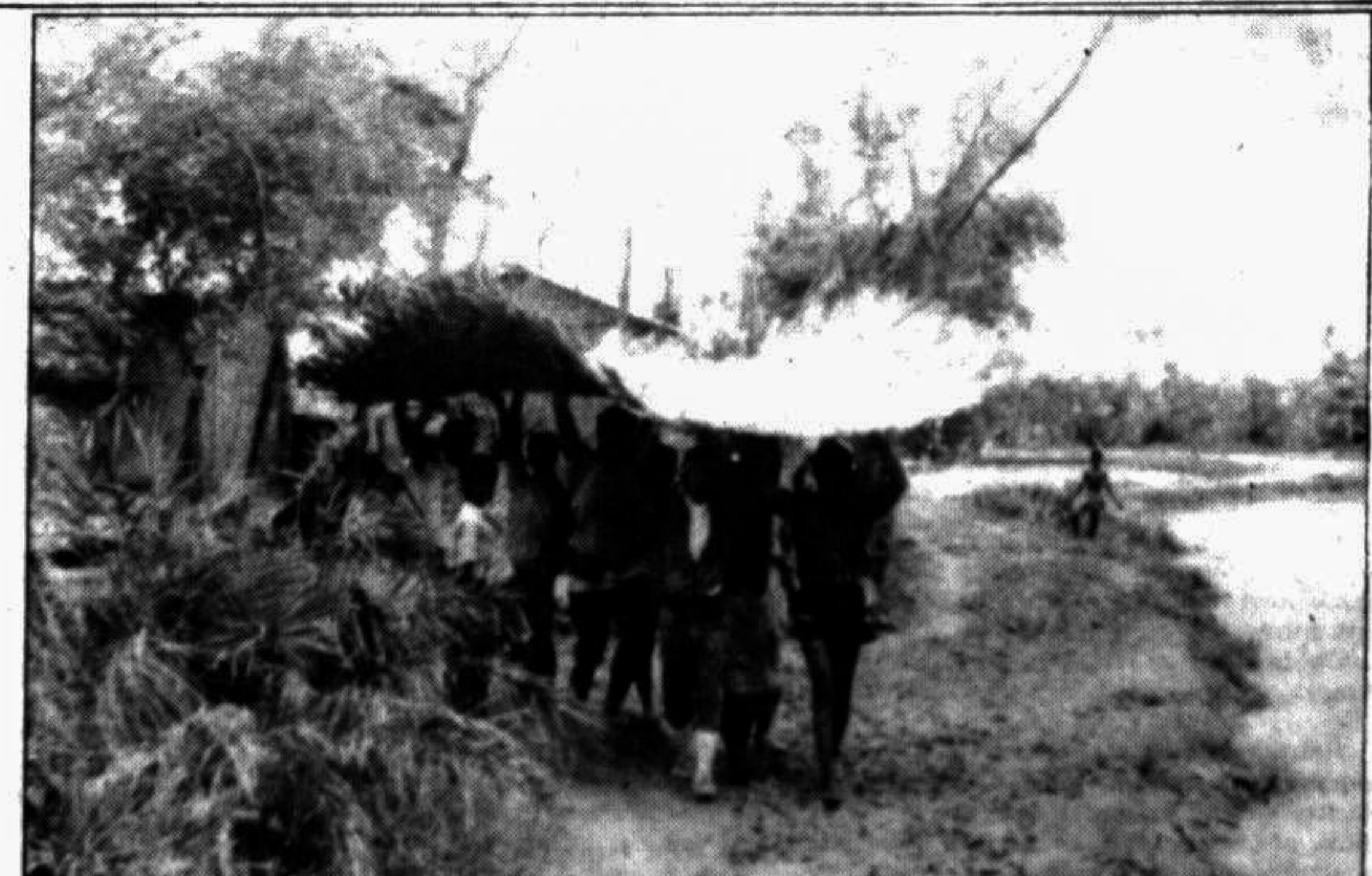
CHITTAGONG: Volunteers of Asian Friendship Society Bangladesh erecting houses at village Gahira (Hariarpara) under Anowara Upazila for the cyclone victims.