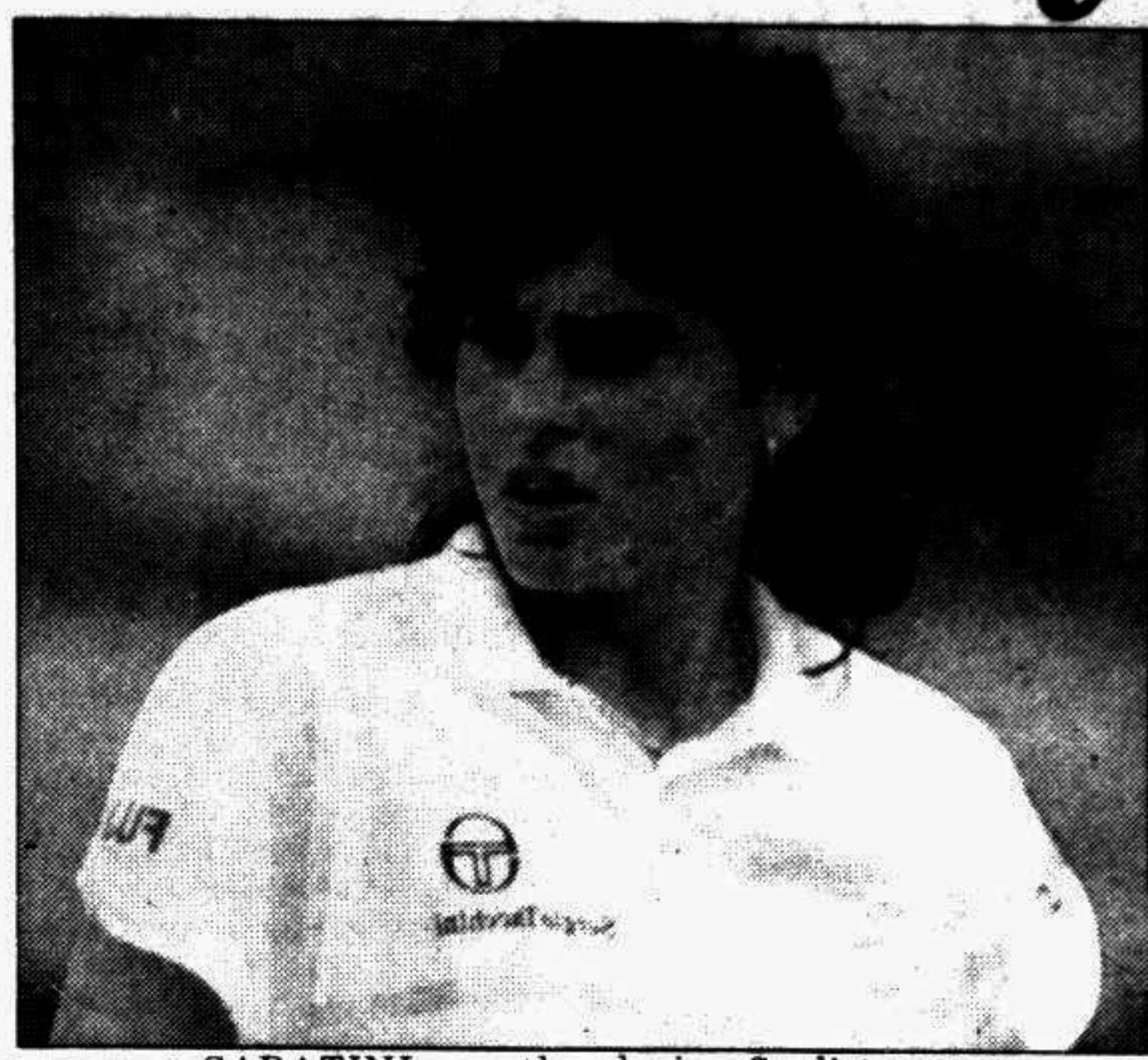
SABATINI — the losing finalist

She opened the second set with two more service breaks, but Sabatini rallied to break