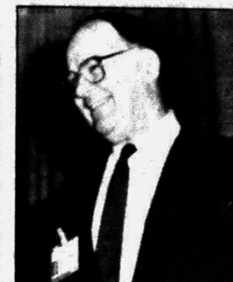
Conable: Priority and efficiency are what the donors look for.

During a recent exclusive interview to The Daily Star, the first of its kind given to a Bangladeshi newspaper, the head of the world's largest aid agency described the expansion of the private sector in a developing country only as a "modality of economic management" and argued that re-