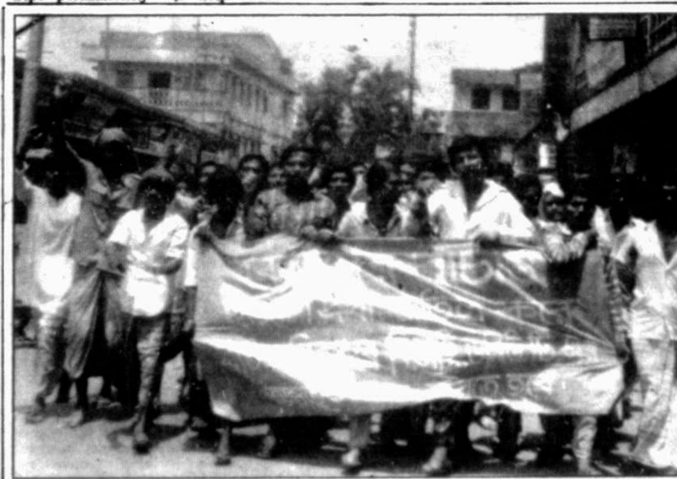
BARISAL: Members of the 'Barisal Ghat Samik Sangram Parishad' brought out a procession recently to press home their demands.