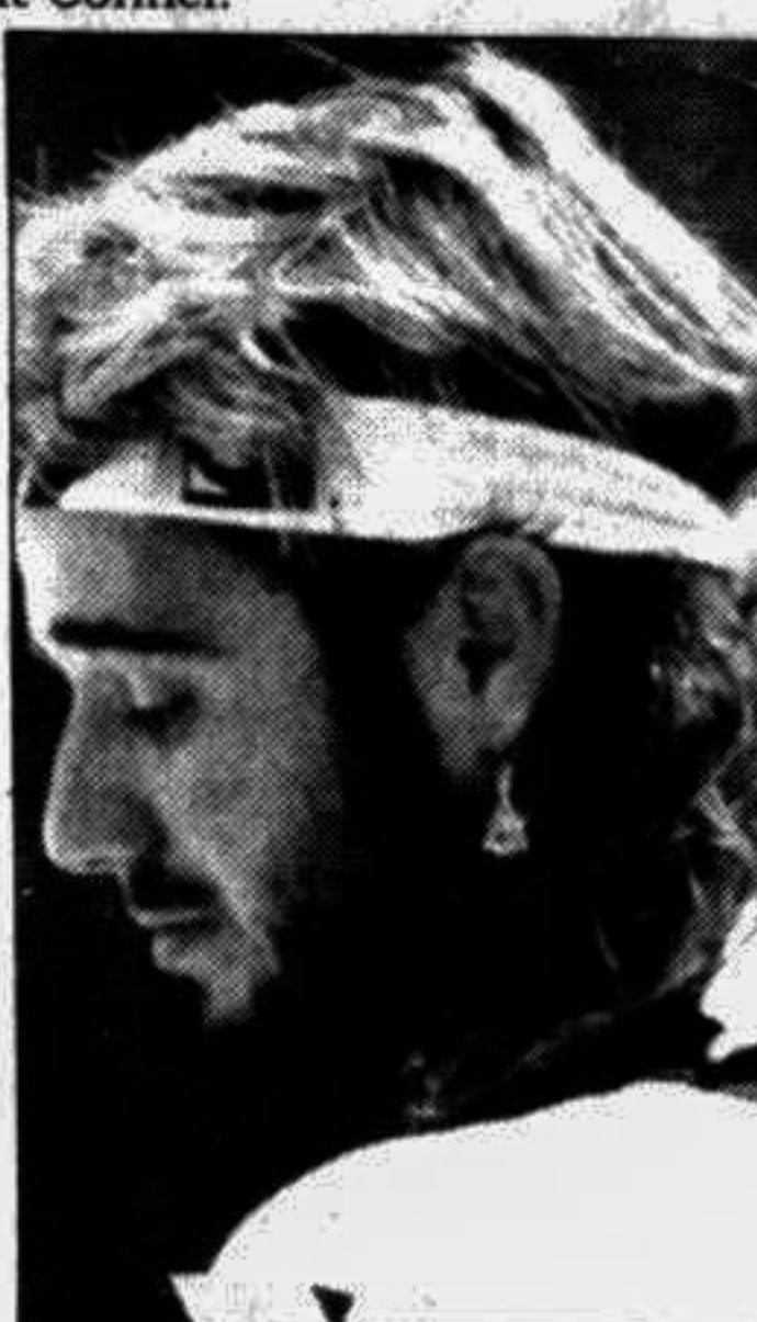
AGASSI a marketing product,

"It's true," he said. "But I don't really want to talk about it."