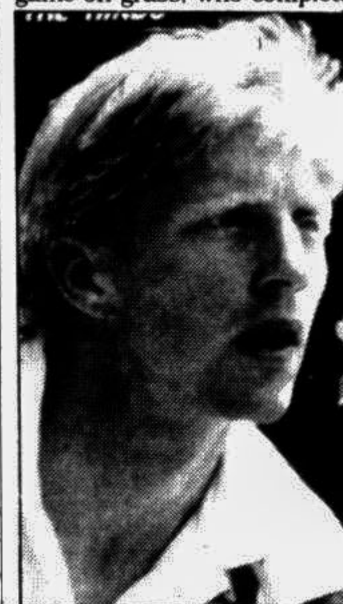
BECKER, the philosopher,

He was preceded by 21-year-old American Andre Agassi, a baseliner playing only his second game on grass, who completed a five-set victory over Canadian Grant Connell.