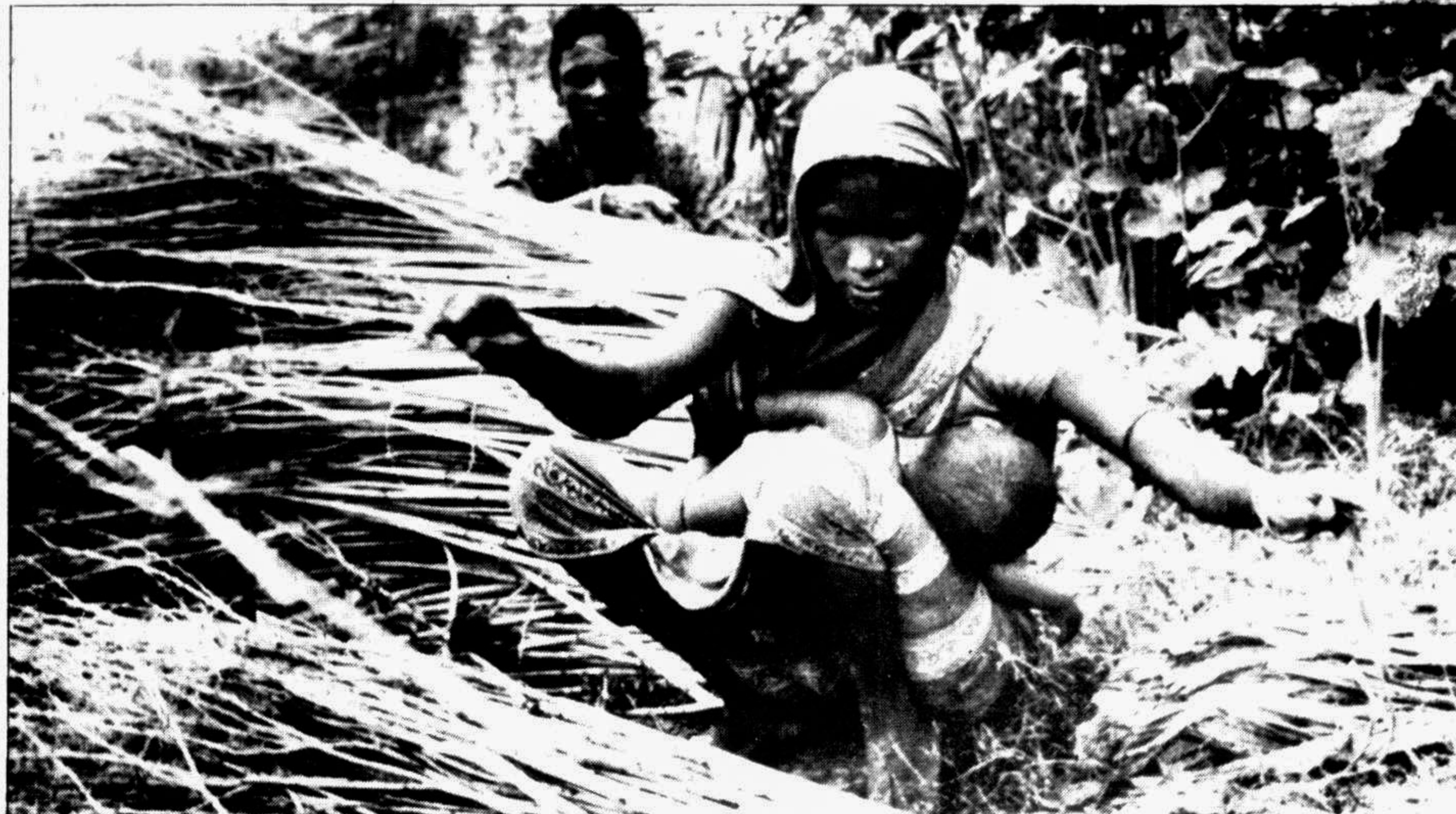
Jute — the golden fibre of the country is gradually losing world market for increased use of synthetic fibres. Growers are also becoming apathetic towards jute farming for not being able to fetch fair price. Photo shows women extracting fibre from the stalk at a village in Mymensingh.

PATUAKHALI, June 28 The prices of edibles including oil have increased abnormally in different markets of Patuakhali and Barguna districts for the last one week, reports UNB. Market sources said before the placement of the budget for fiscal 1991-92 in the Jatiya Sangsad, per kg soyabean oil was sold at Taka 33. But now it is being sold between Taka 40 and 42 affecting the common consumers adversely. Moreover, prices of powdered milk, baby food have also shot up in the markets. It is alleged that a section of dishonest traders have been creating artificial scarcity of essentials to earn maximum profit.