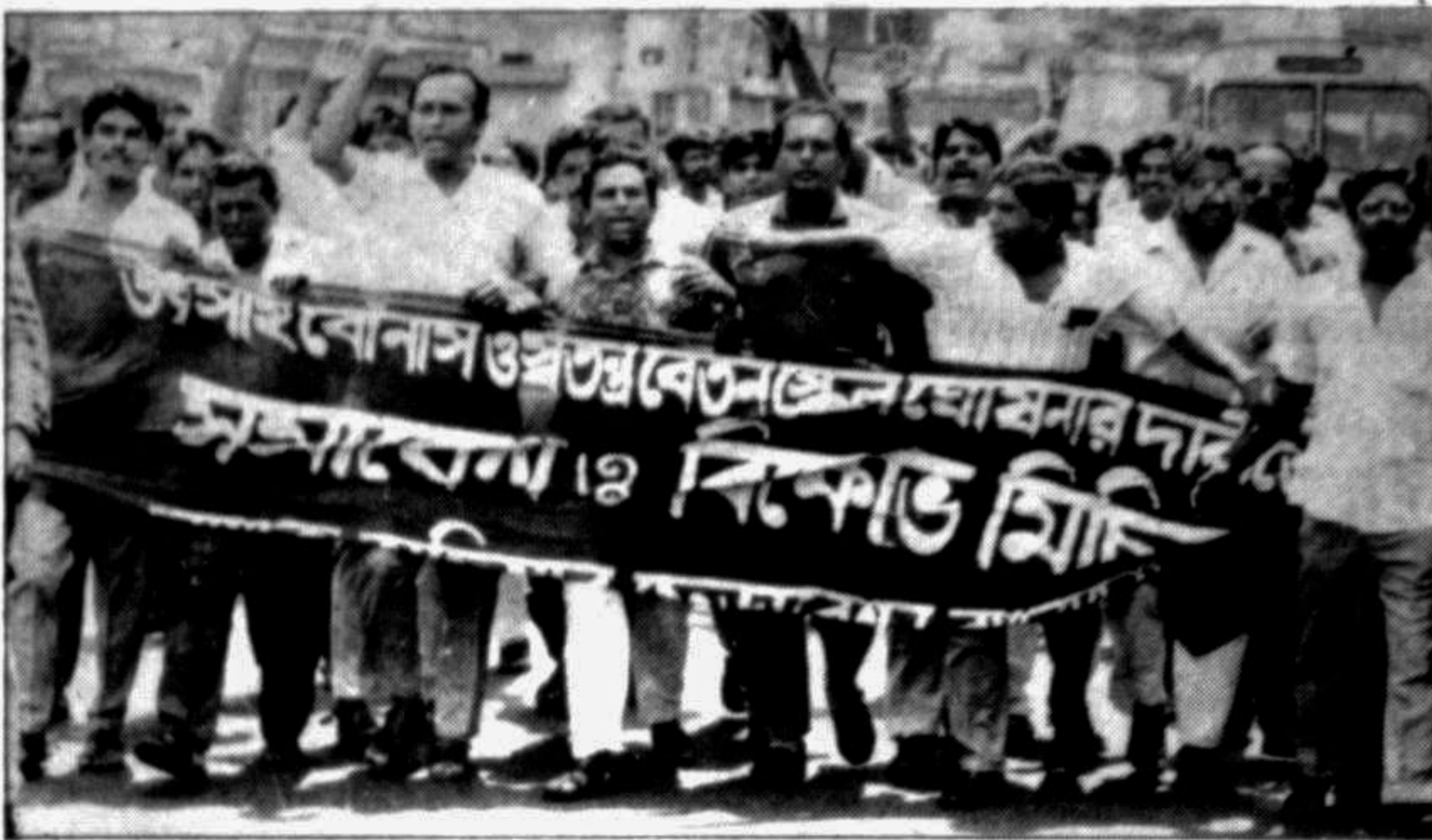
Bank employees brought out a procession in city on Saturday demanding bonus.

According to his itinerary released to the press by Rabiatul Al-Alam Al-Islami on Saturday.