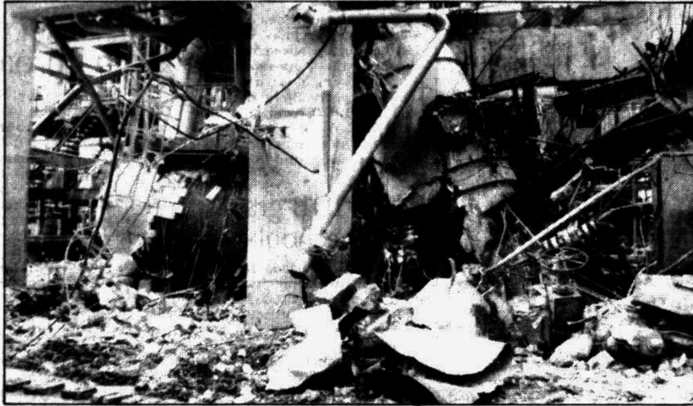
The damaged ammonia plant of Ghorasal Fertilizer Factory. The newly installed plant exploded late Wednesday night setting off a cloud of toxic gas in which eight persons were killed.