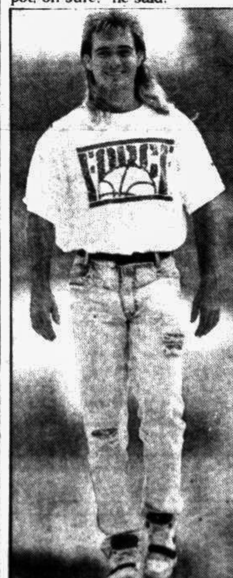
ANDRE AGASSI — a sudden change of mind

TECTED lifestyle of the East, where she earned only 50 dollars a race, for all the trappings of capitalist success in the new Germany. Reckoned to be earning about 300,000 dollars a year for track appearances, as well as fashion and modelling contracts, she says she cannot go anywhere since her triumph in Split without being mobbed by well-wishers. Today she looks every inch the glamour symbol of the new Germany, wearing her expensive designer jeans and blouse, as well as diamond ear studs, when she attended a news conference. "My new lifestyle has many advantages," she said. "But sometimes I wish I could go back to the situation I was in three years ago."