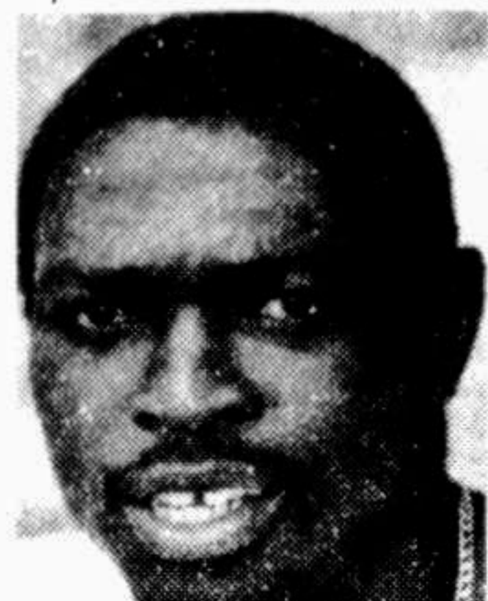
PATRICK PATTERSON said tour manager Lance Gibbs. "He's had some treatment already and will have some more tomorrow. It's too early to say

"He slipped in the foothold during his delivery stride,"