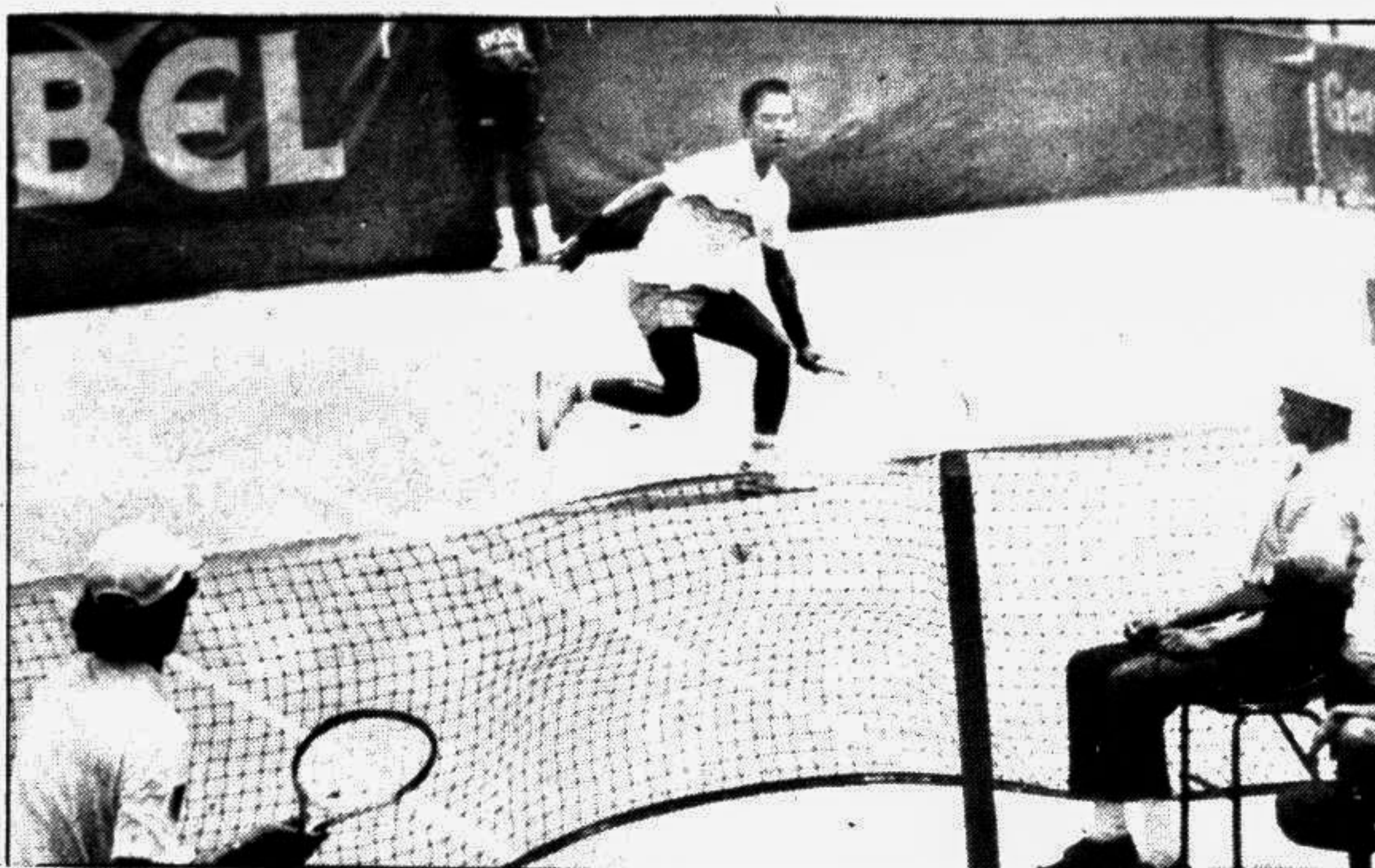
Action from yesterday's reverse singles of the Davis Cup Asia-Oceania Group Two tie at Ramna Tennis Complex.