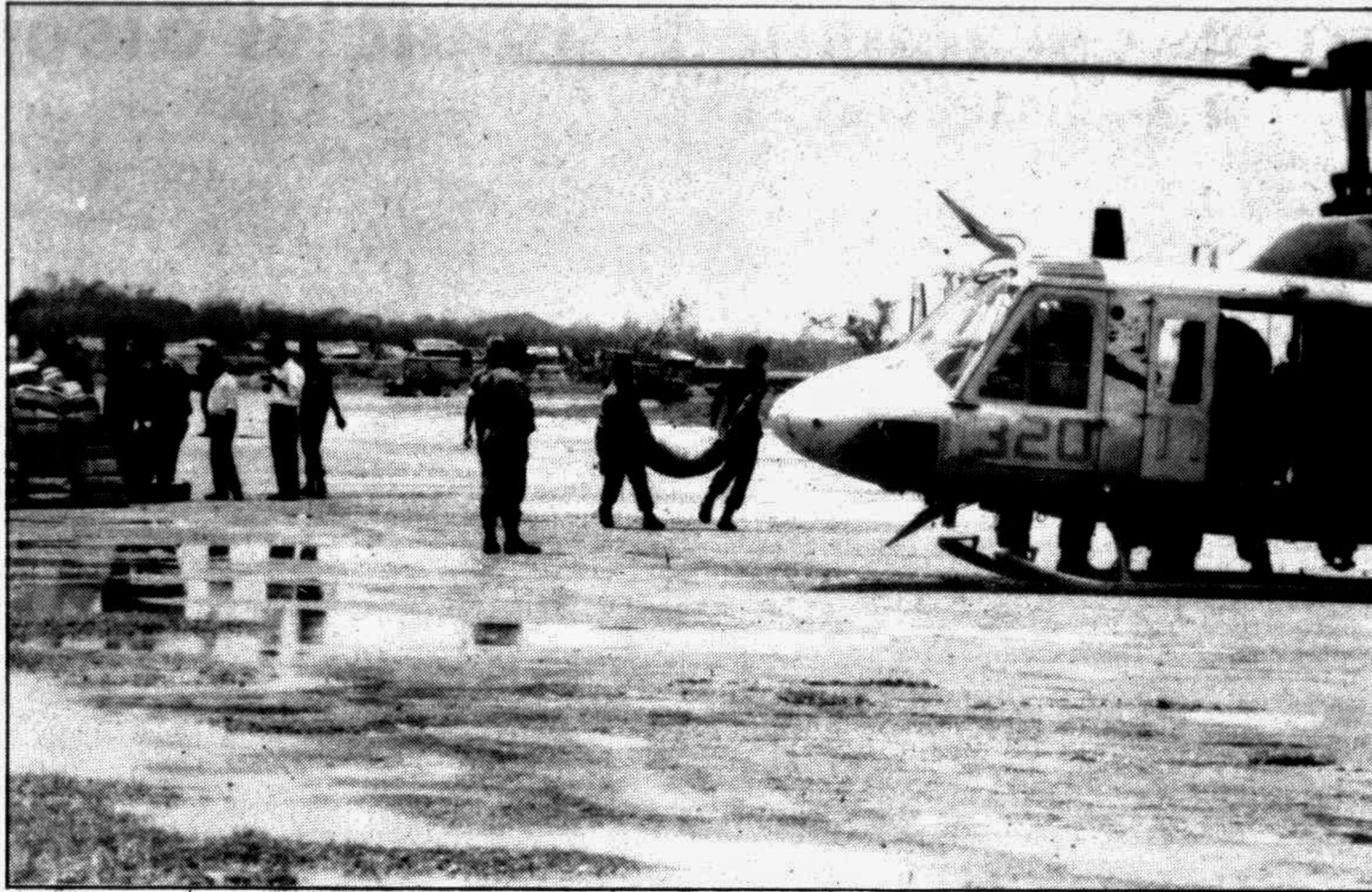
US Marines load relief supplies aboard a UH-1N Huey Helicopter at Chittagong. The supplies were taken to outlying areas, where residents are living with the devastation of recent cyclone.

The villagers demanded punishment for the eight members including UP Chairman for misconduct, and misappropriation of money and power misuse.