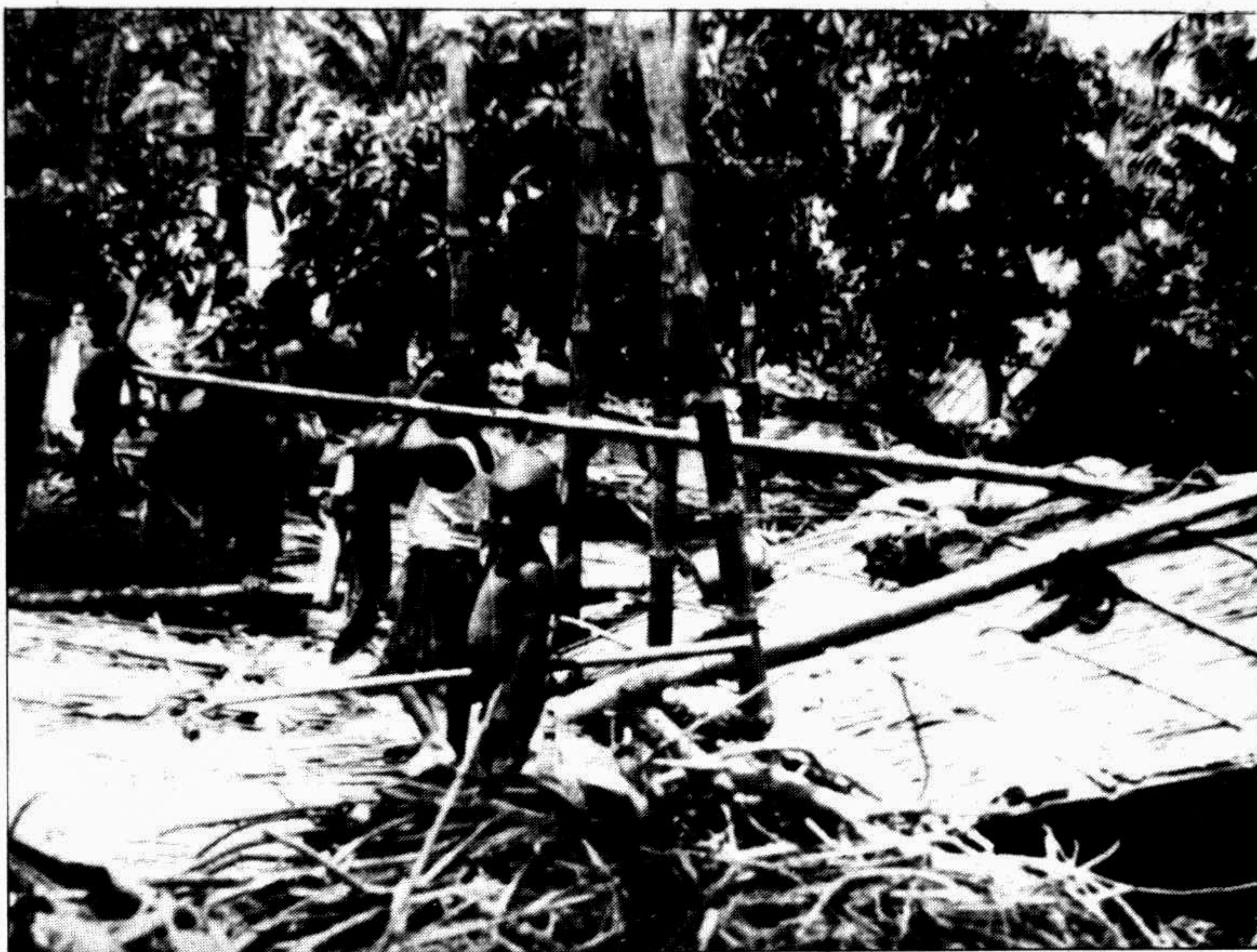
PABNA: A house ravaged by the recent tornado at the outskirts of the town.