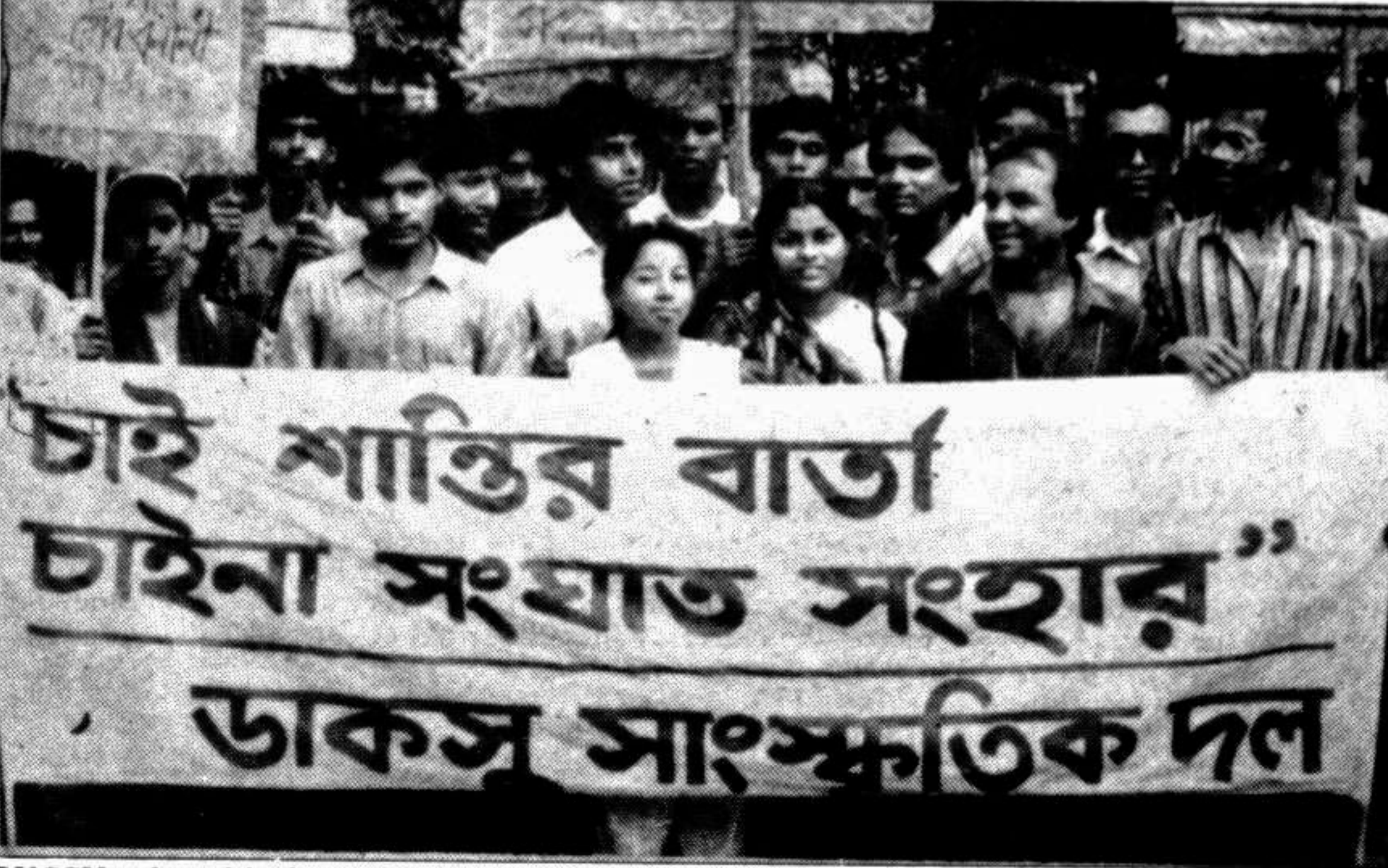
DUCSU cultural body brought out a procession on Sunday seeking peace, not violence on the campus.