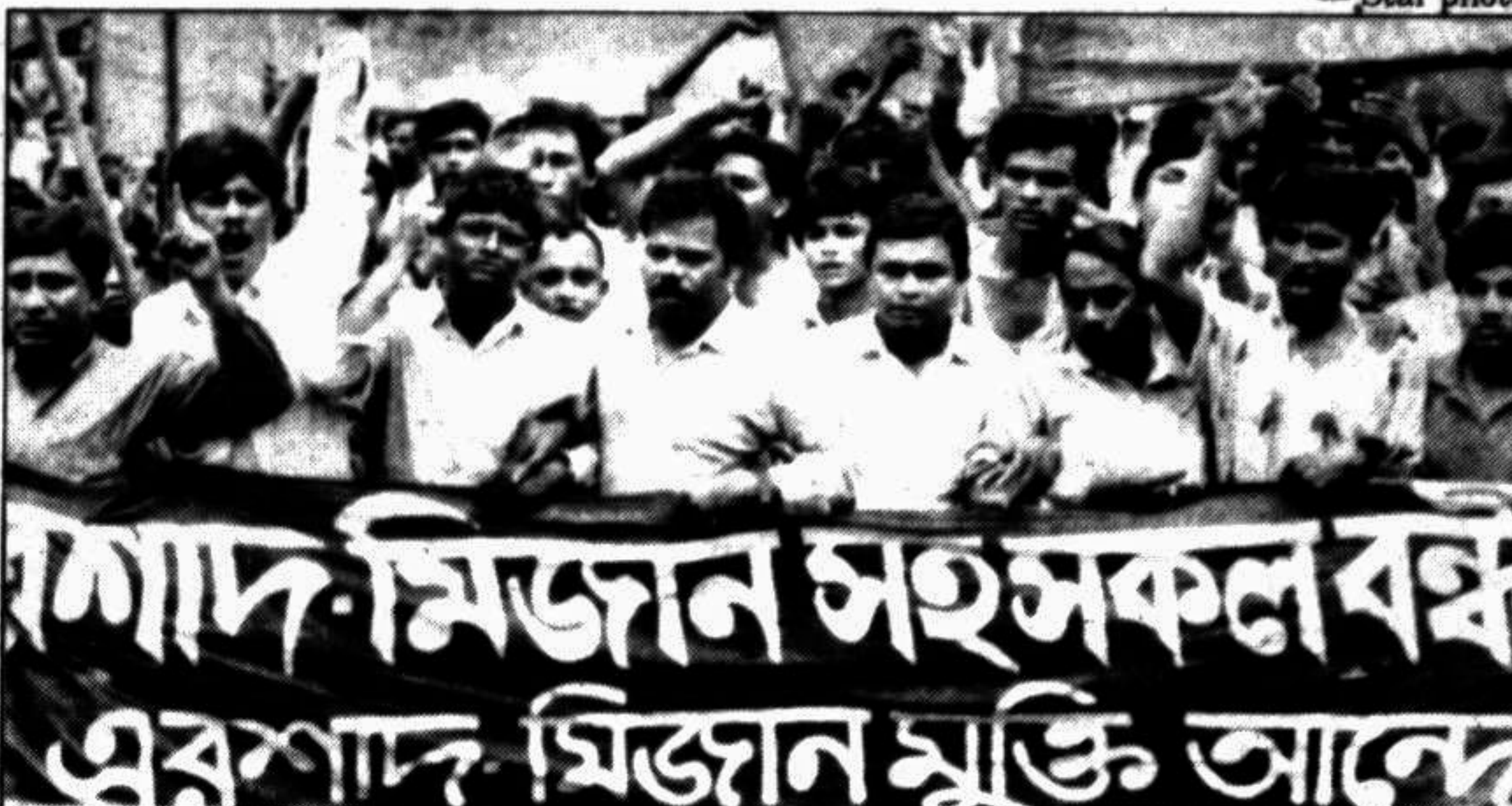
Jatiya Party activists holding demonstration in the city on Sunday demanding release of Ershad and other party leaders.