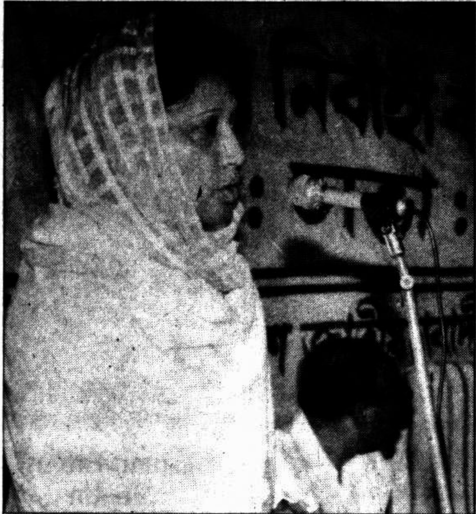
BNP Chair person Begum Khaleda Zia speaking at the meeting of the party's central executive committee on Sunday.

The Bangladesh Nationalist Party (BNP) has decided to switch over to a parliamentary form of government with adequate checks to stop floor-crossing.