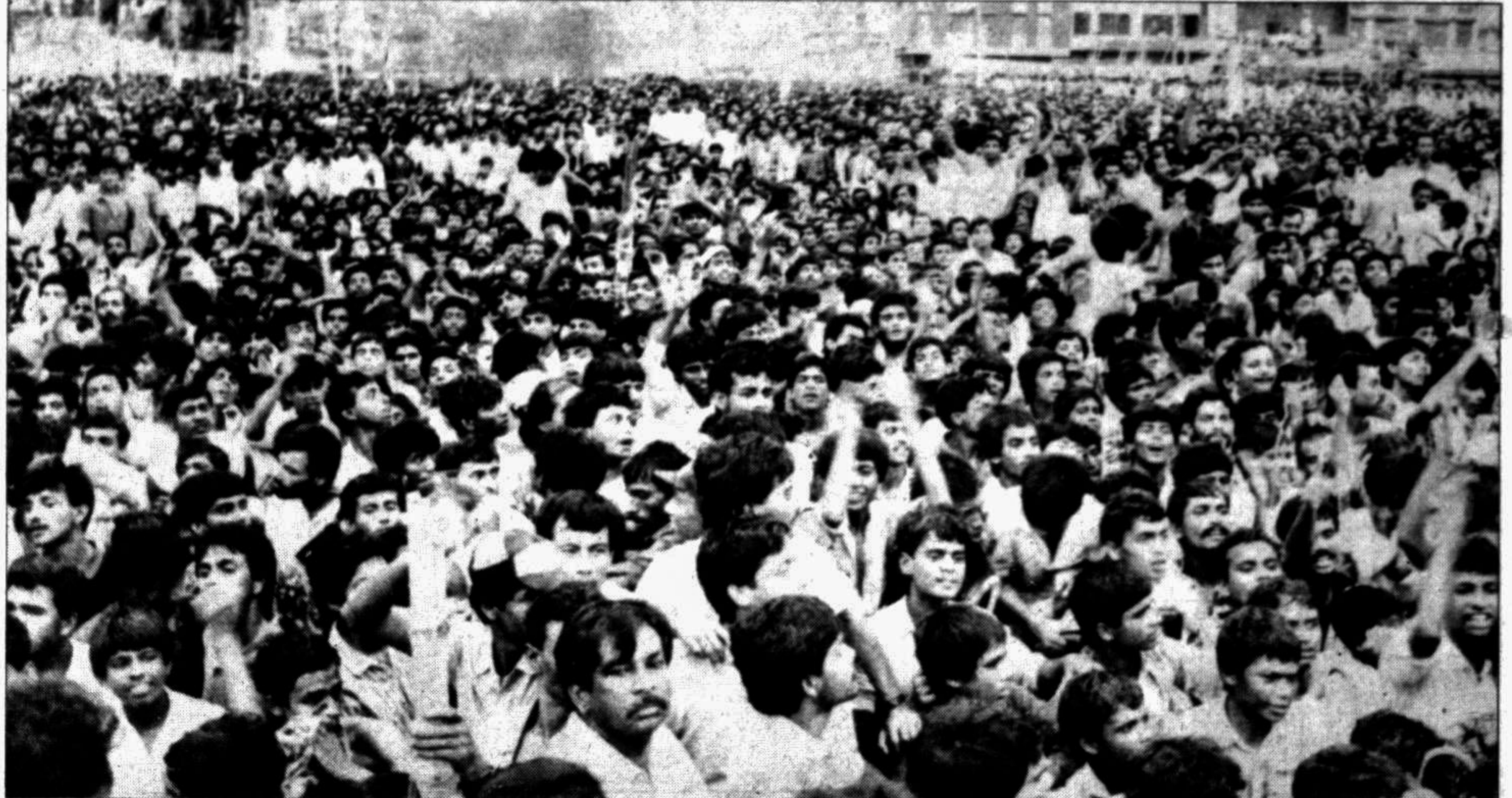
Partial view of the public meeting organised by city BNP at the Gulistan square on Thursday.