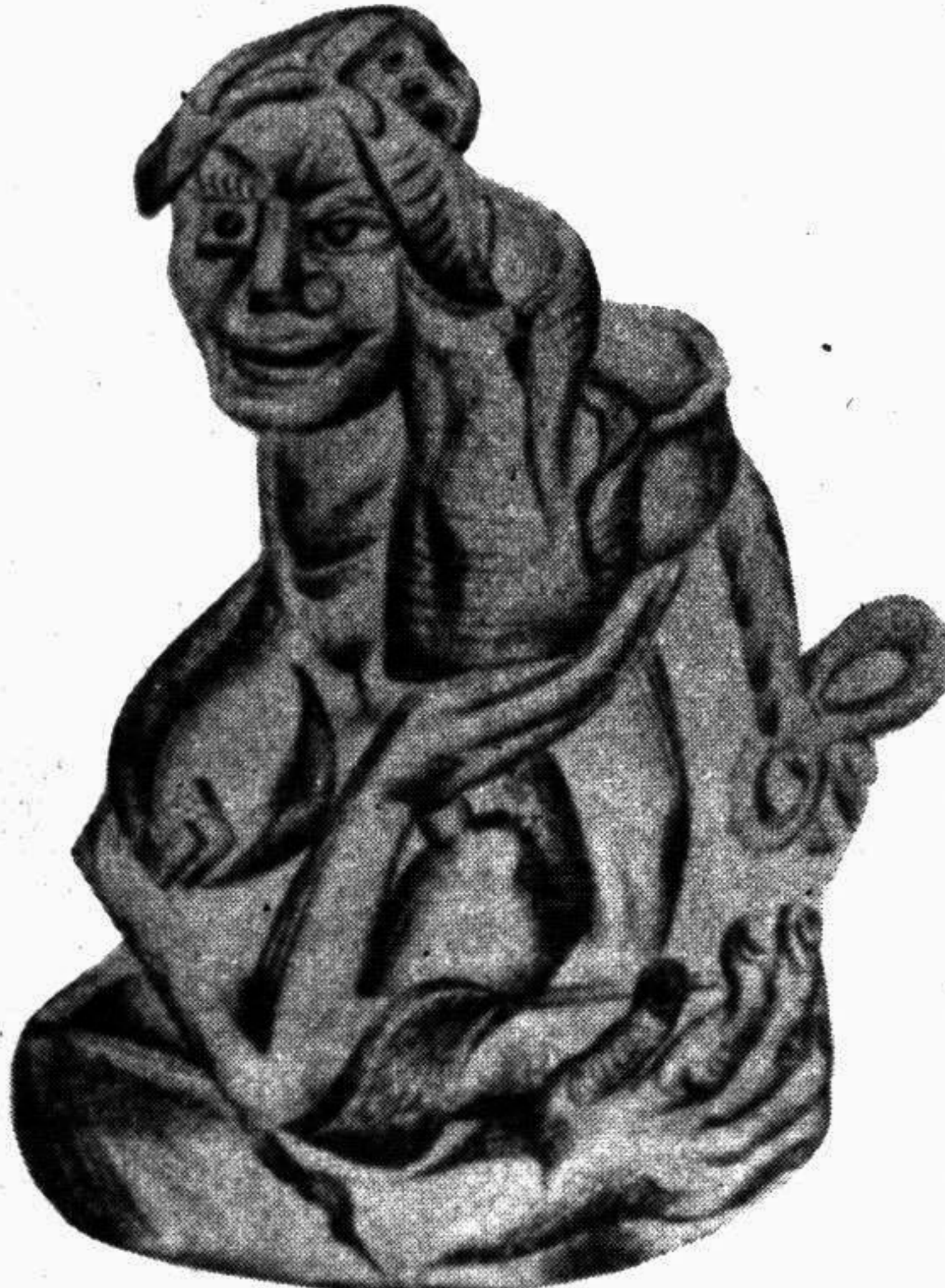
She the Deprived