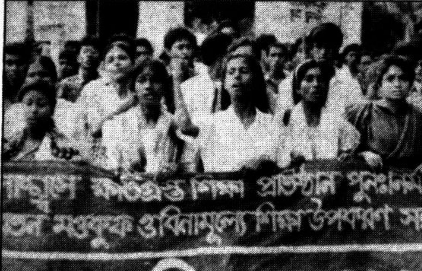
Samajtantrik Chhatra Front brought out a procession Wednesday on the campus demanding the repair of educational institutions damaged by recent cyclone.

The combination of self sufficiency in ORS production, tubewell water and a latrine in every house will dramatically reduce diarrhoeal diseases. Diarrhoea is a chronic long-term problem.