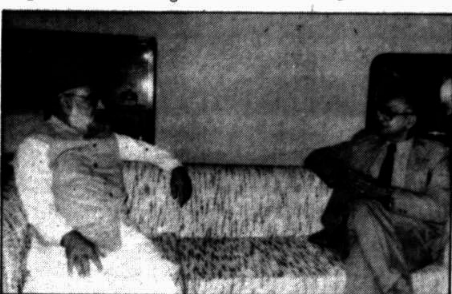
Senator Kazi Hossain Ahmed, leader of the visiting three-member parliamentary delegation of Pakistan called on Foreign Minister ASM Mustafizur Rahman on Wednesday at the letter's office.

Senator Ahmed said the delegation will work to create public opinion at home and abroad to generate assistance for Bangladesh to overcome the disaster.