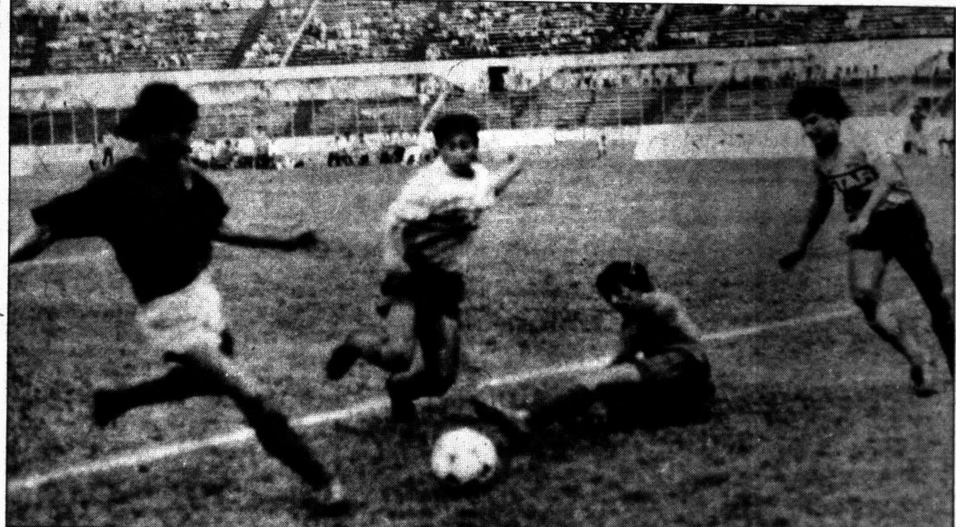
Action from yesterday's second semifinal between Mohammedan Sporting and Mohun Bagan at Dhaka Stadium. MSC won 1-0 to set up a final with Abahani KC in the 8-day BTC Club Cup meet. Story on Page 7.