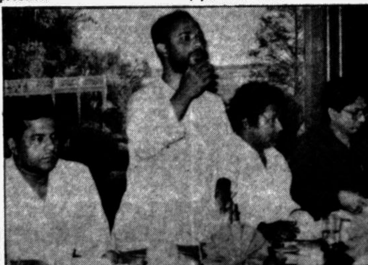
Chairman of Upazila Chairman Association addressing a press conference at a local hotel on Saturday.