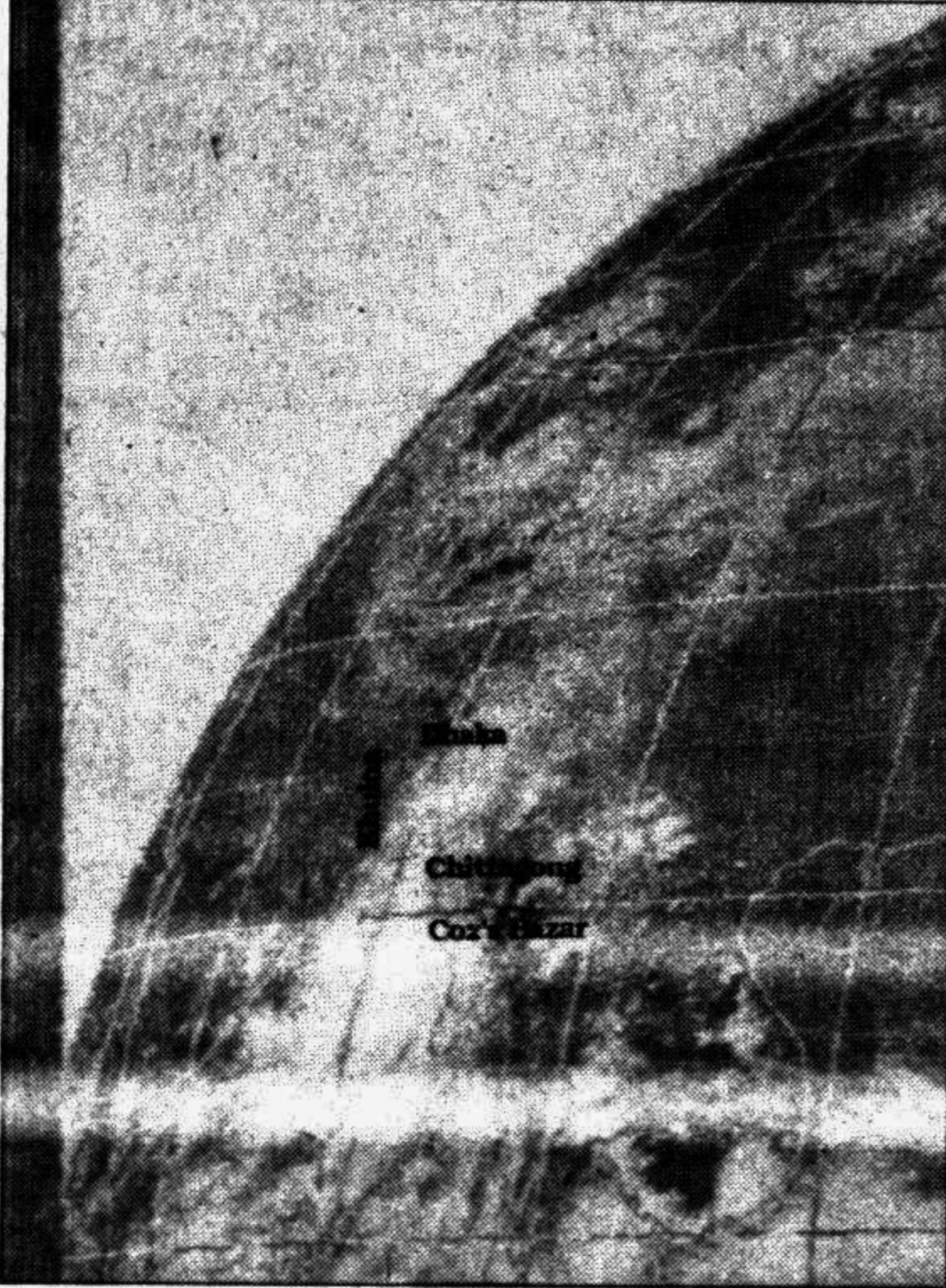
Satellite picture of the cyclonic storm taken on Saturday.

A cyclonic storm with a maximum windspeed of 100 kilometres per hour hit the coastal belt of Bangladesh from Patuakhali to Chittagong in the early hours of today. The storm, the second in just over a month, has been a severe blow to the people of the coastal areas who were devastated by the April 29 cyclone which had a maximum windspeed of 235 kilometres per hour and whipped up a tidal surge 12 to 20 feet in height. Low-lying areas of the coastal districts have been inundated both by heavy downpours and tidal surge, six to eight feet in height, caused by the cyclone this morning. The cyclone marks a slight deviation from the normal. In the premonsoon season cyclones come over Bangladesh in April and May and rarely occur in the month of June. Hamiduzzaman Khan Chowdhury, Director, Bangladesh Meteorological Department told the Daily Star last night only in 1982 they had recorded a cyclone in the month of June. That cyclone had, however, recurved after coming over the north Bay and moved straight eastwards before hitting the Burma coast on June 6. Between 1970 and 1990 no more cyclones were observed in the Bay of Bengal