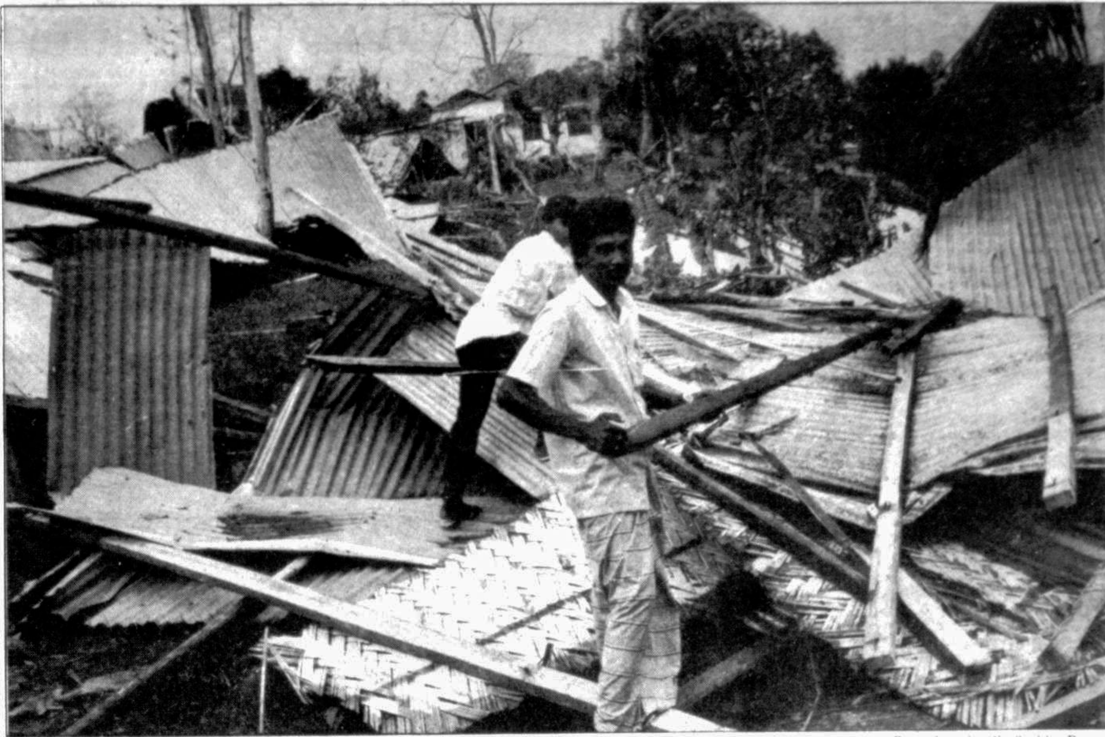
Houses damaged by the recent catastrophic cyclone at Langu upazila in Rangamati

Earlier in three phases huge relief materials of above kinds worth about Taka 2,91,000 have also been sent to the affected people of the recent tidal bore areas of the country.