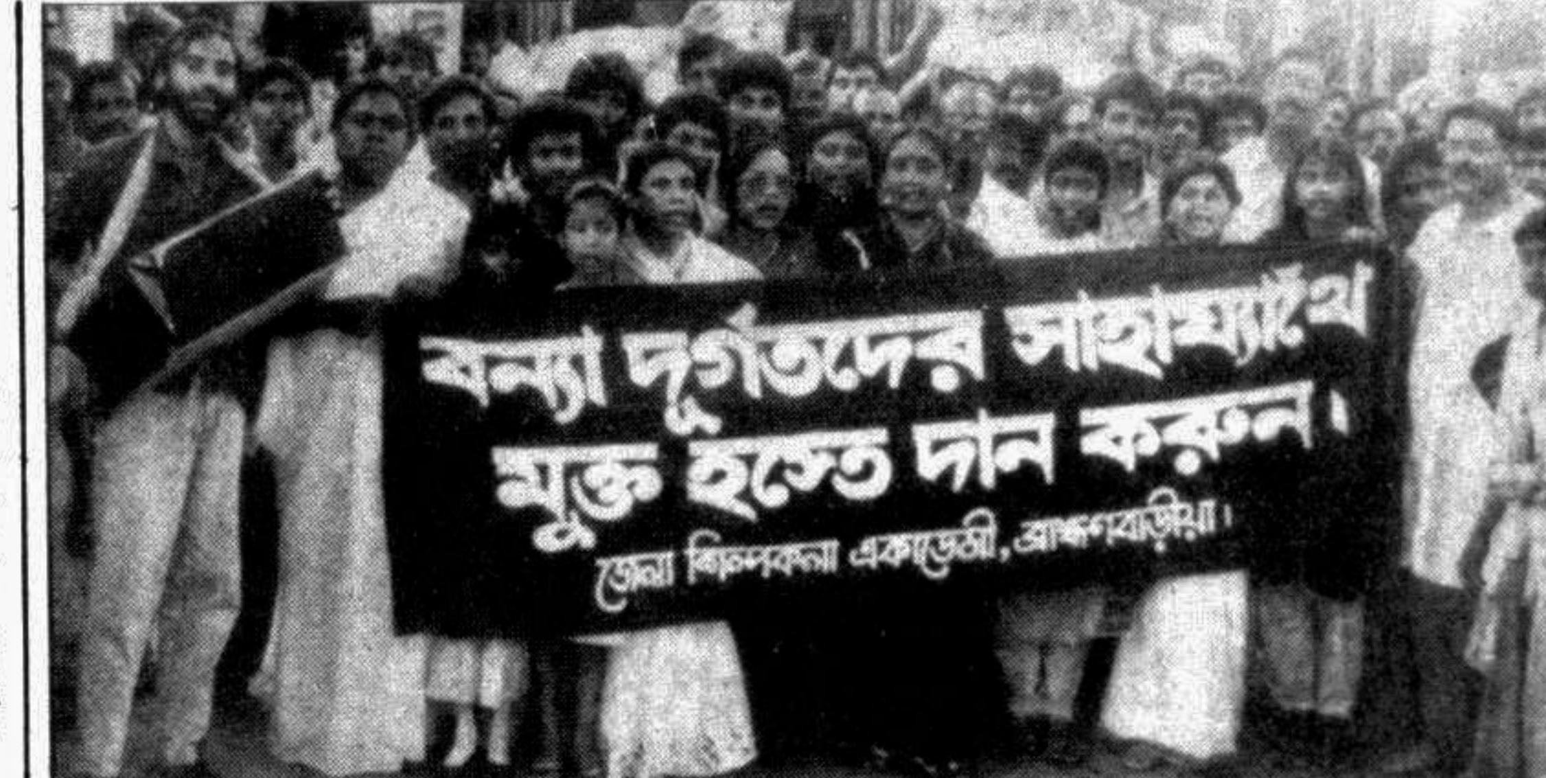
BRAHMANBARIA: Members of the local Shilpakala Academy collecting donation for the cyclone victims of coastal areas.

His body was sent to his village Gangair under Ghatail upazila in Tangail district without autopsy.