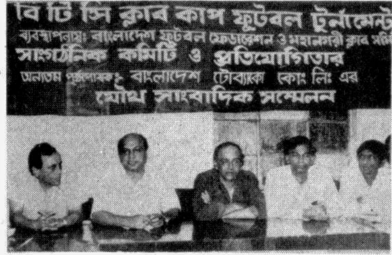
BFF and BTC Club Cup soccer tournament organising committee officials addressed a press conference at the Dhaka Stadium yesterday.