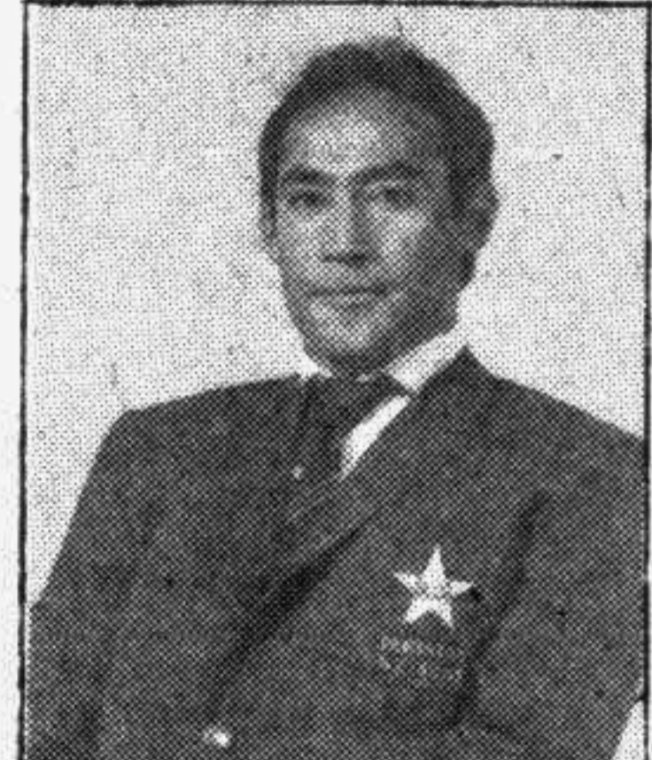
MUDASSAR NAZAR Association, the league in the north-west of England, reports AFP. Mudassar, who is in his first summer as a professional with Bolton, has notched unbeaten centuries in his last two innings.

BOLTON, England, May 29: Pakistani Test all-rounder Mudassar Nazar has become the first player to reach 500 runs this season in the Bolton