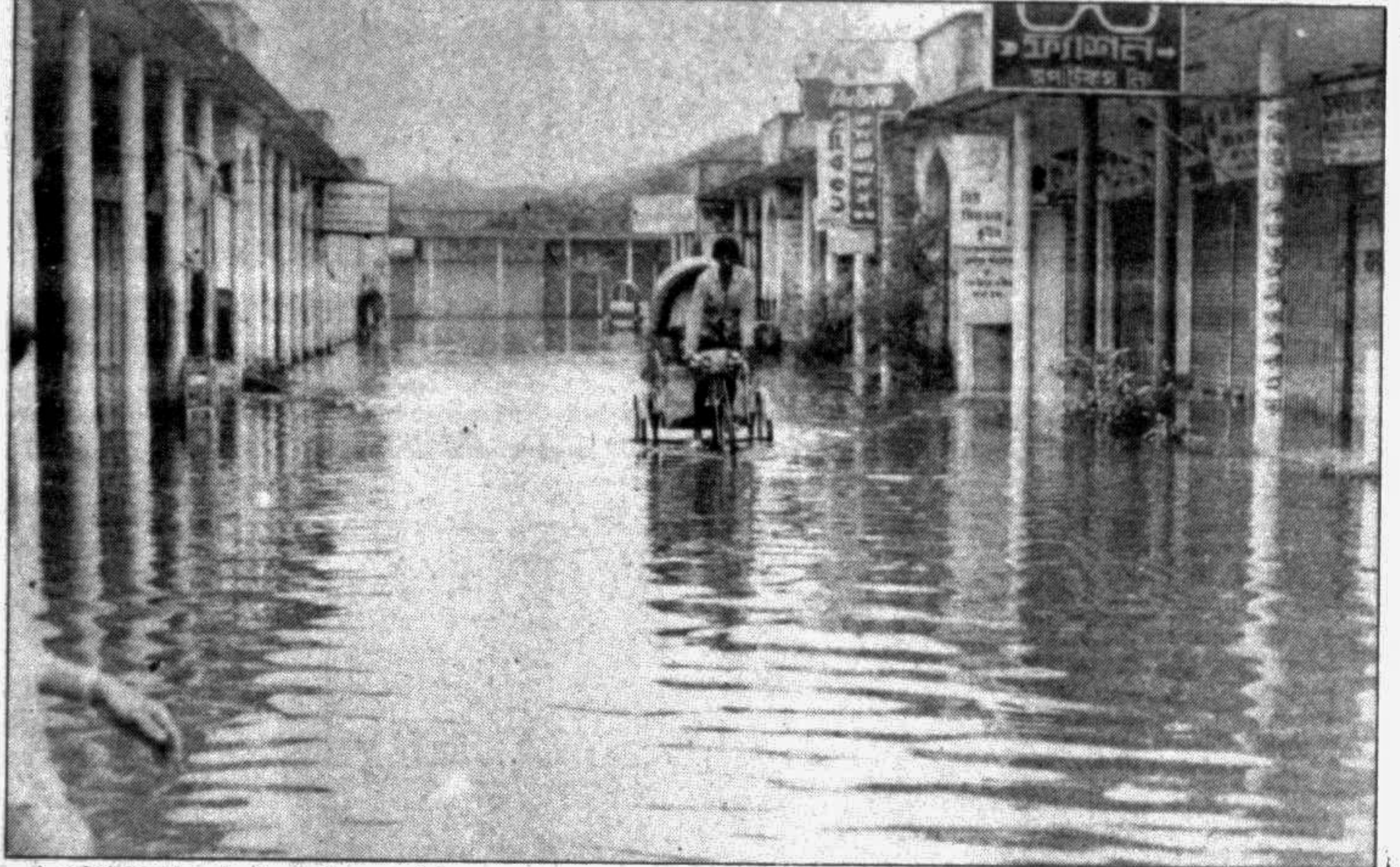
A rickshaw ploughs through one of the many streets water-logged by incessant rainfall Tuesday. The downpour brought vehicular traffic to a near standstill.

Moulana Abdus Sobhan, an MP of Jamaat-e-Islami, met the Acting President, Justice Shahabuddin Ahmed, at the President's Secretariat on Tuesday, reports BSS. Moulana Sobhan complained to the Acting President that Moulana Matur Rahman Nizami, MP and leader of Jamaat's parliamentary party, was severely assaulted by some students of Dhaka University in the presence of the Vice-Chancellor at whose invitation Moulana See Page 10 Col. 4