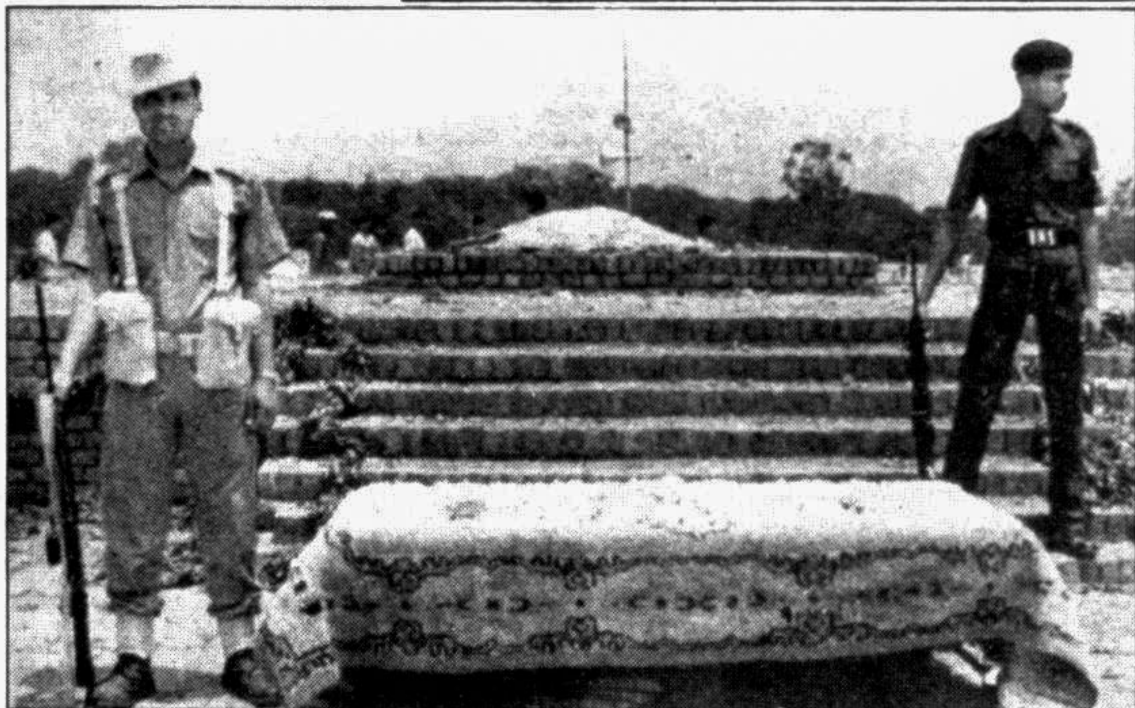
NEW DELHI: Armed security officers guard the ashes of slain former Prime Minister Rajiv Gandhi May 25, one day after the body of the Congress (I) Party leader was cremated.