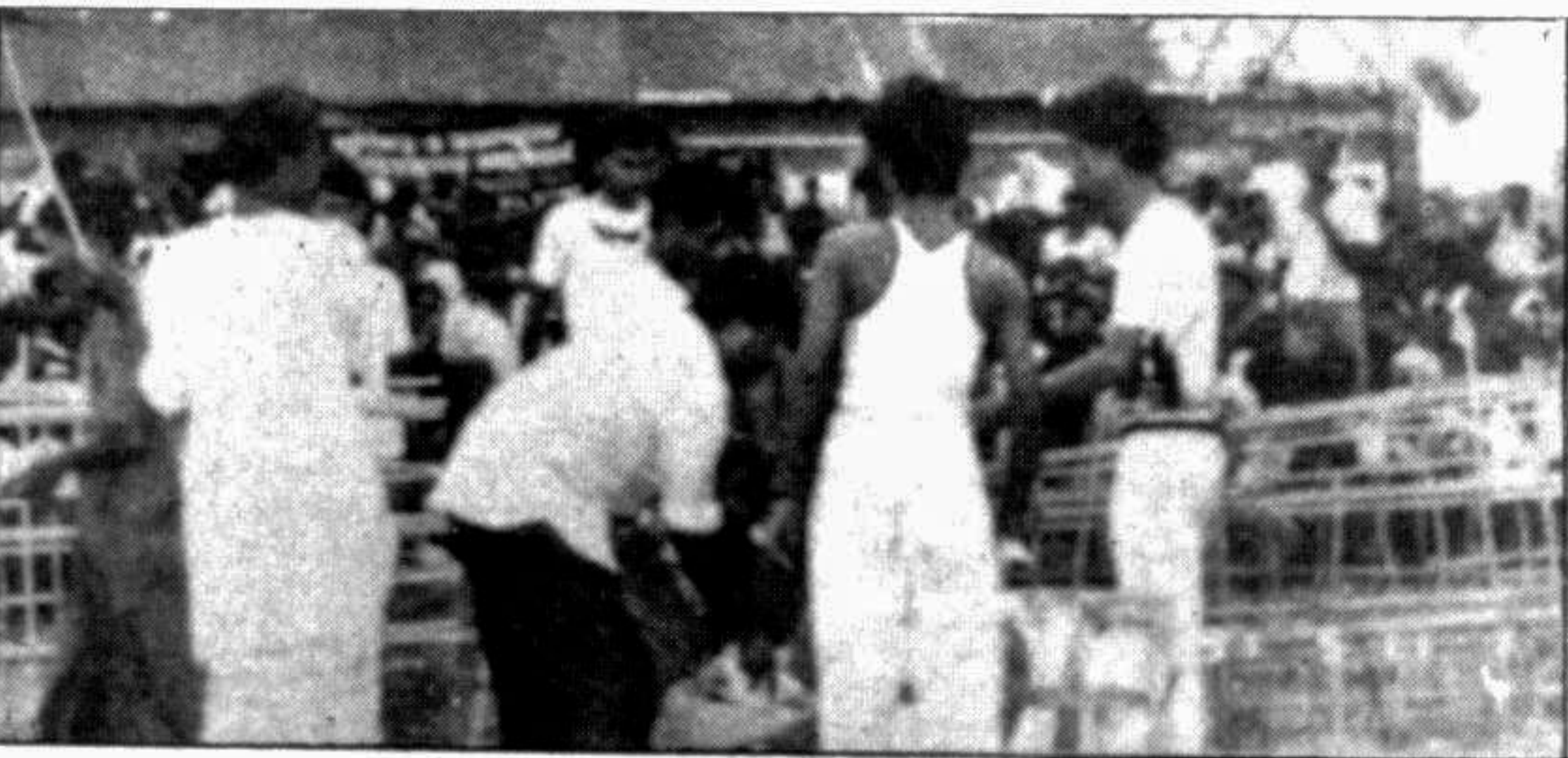
Members of Maitri Samaj Kalayan Sangha, Dhaka distributing relief materials among the cyclone affected people at village Chhanua under Banshkhalhi Upazila.

In another incident food grains worth Taka 10 lakh allocated under VGD and other programmes was allegedly misappropriated by Acting Secretary General of Jamalpur district Jatiya Party who was also the Chairman of Mahmudpur Union Parishad under Melandah upazila, during the Ershad regime.