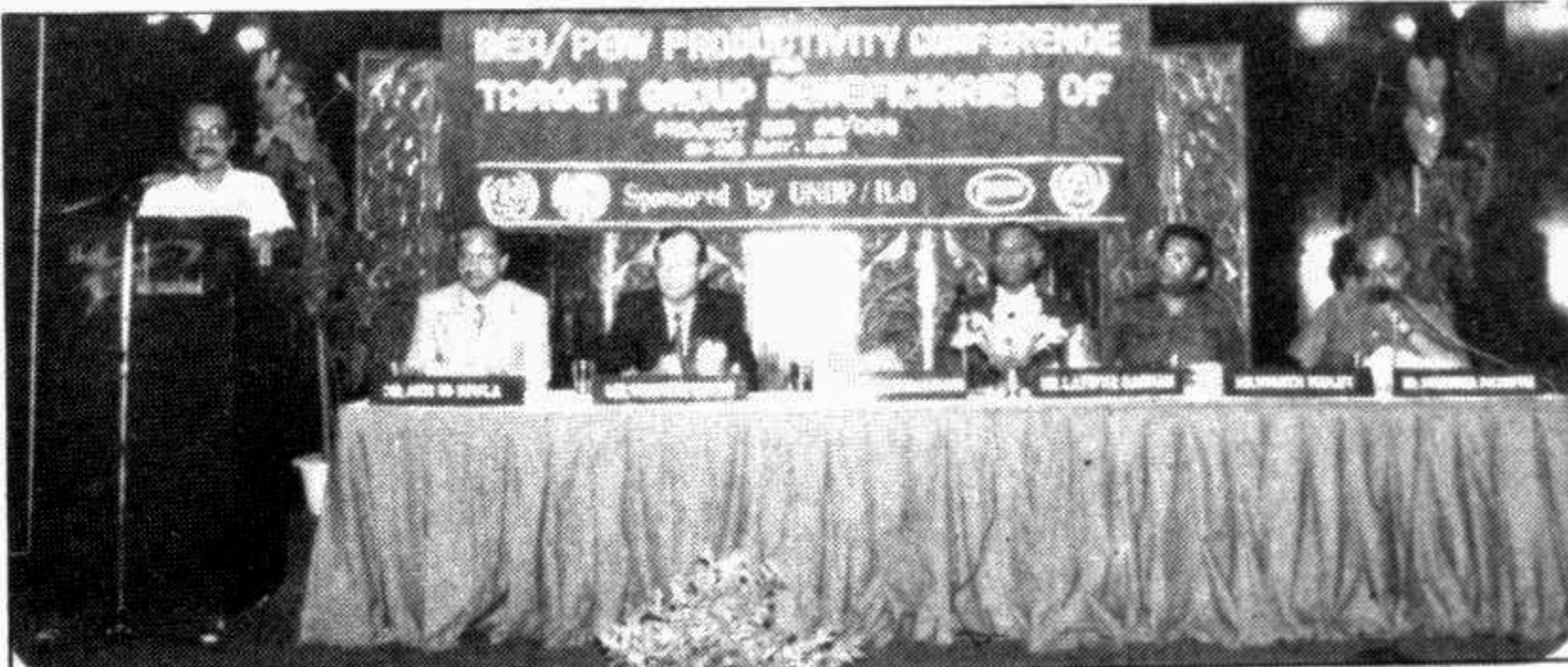
Productivity Services Wing of Bangladesh Employers' Association organised a productivity conference for target group beneficiaries at a local hotel in Tuesday.