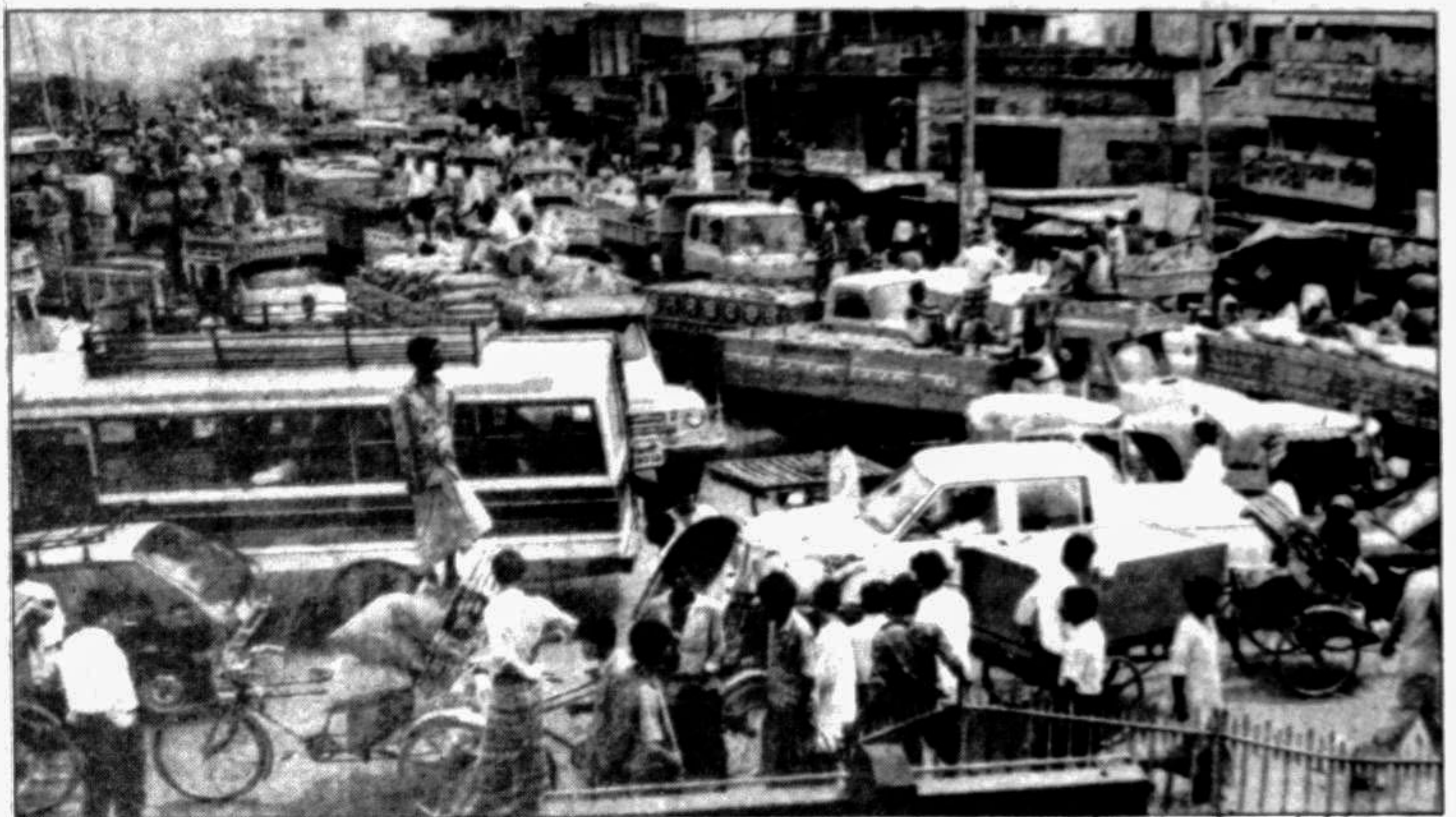
Total road blockade at Jatrabari on Monday when drivers sieged the road in protest against detention of a truck driver at Demra Police Station

She conveyed greetings of the people of Bangladesh to President Mikhail Gorbachev and the people of the Soviet Union.