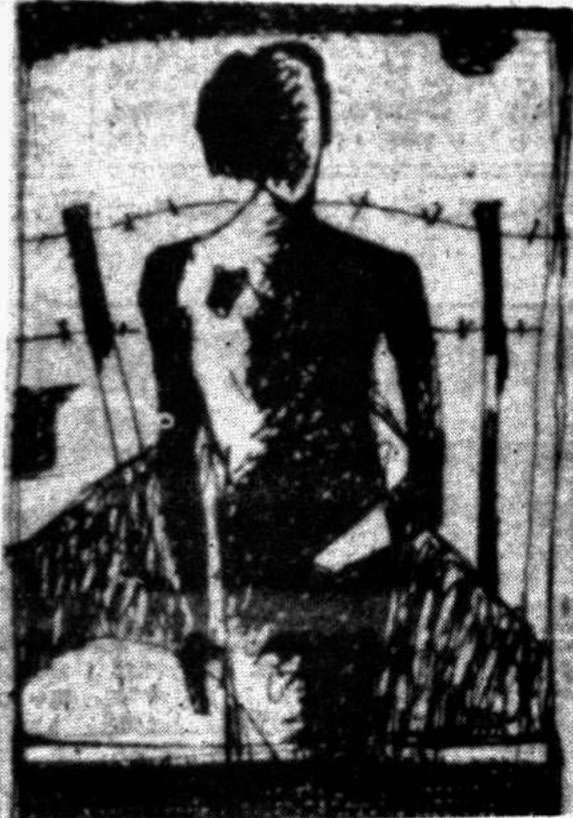
Man-I Pen & Ink