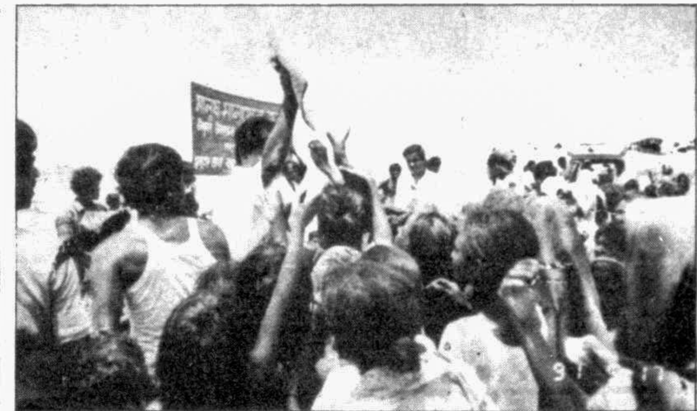
Friends of Bangladesh a non-government organisation is distributing relief materials among the cyclone battered people of Chokoria.