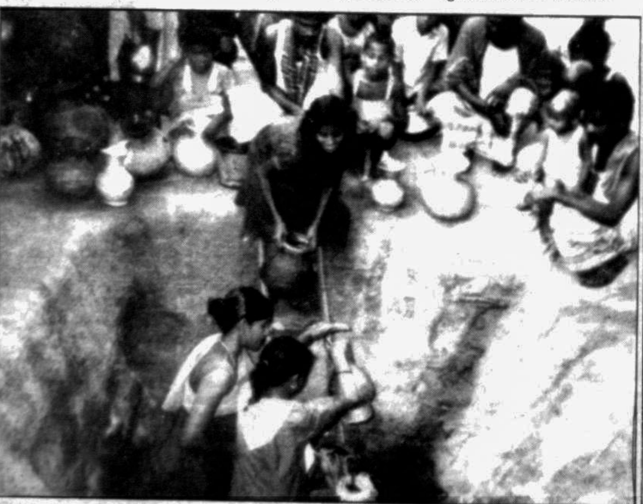
Underground water level in Pabna has fallen alarmingly following persistent drought. In desperation, the local people have dug a 10-foot hole on the ground and installed tubewell to lift water.

Public Prosecutor, Nazrul Islam Miah conducted the prosecution case while Advocate Abdur Rahman Bakul stood for defence.