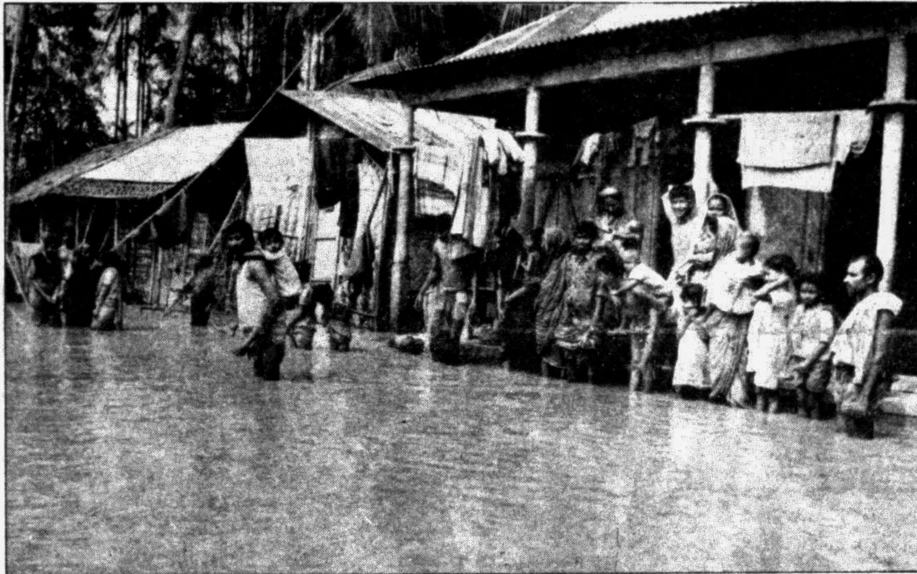
Part of Moulvibazar town submerged in flood water.