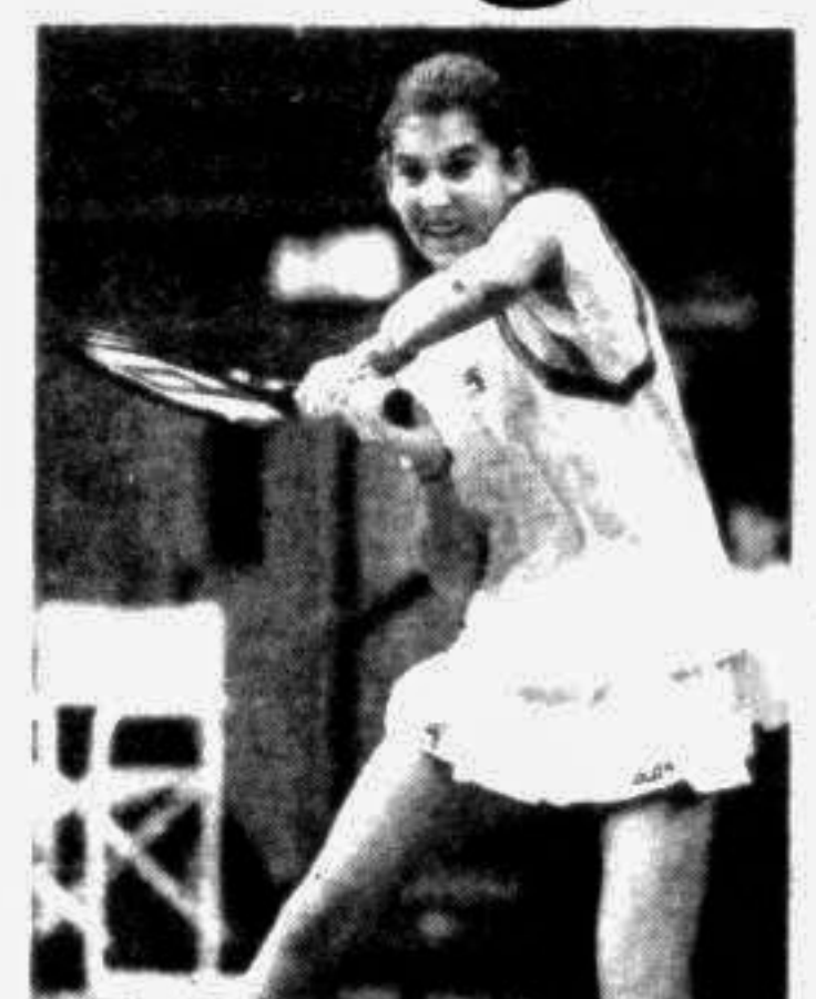
Seles, who took over the number one spot from Steffi Graf of Germany in March, said it is not easy adjusting to being the world's best.

Seles, sporting a new short haircut, came to Rome to de-