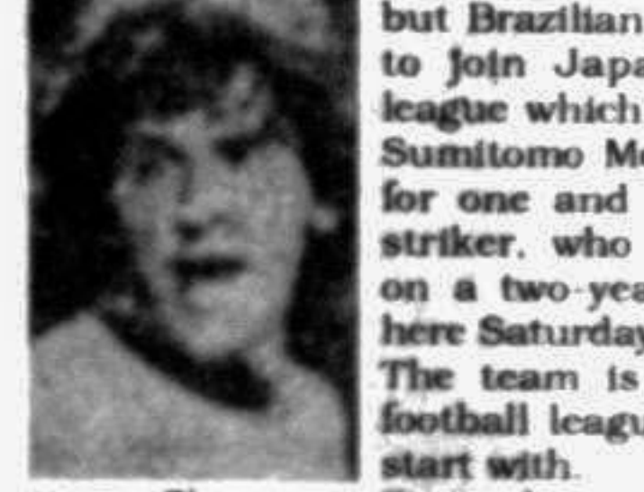
Zico, who played in the World Cup in 1978, 1982 and 1986, served as Brazil's secretary of sport for a year until last month.