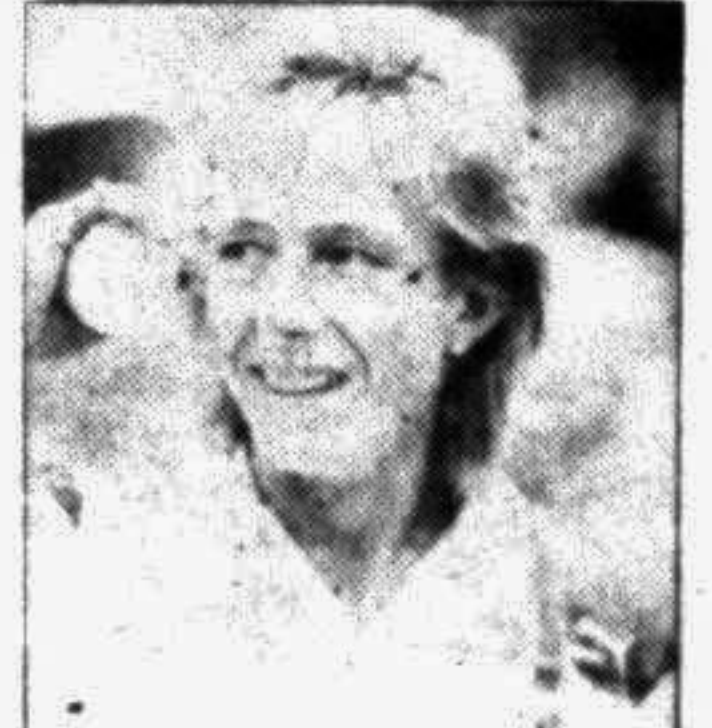
MARTINA NAVRATILOVA has more titles than the combined Italian Open field. Currently the world's fourth-ranked player behind Seles, Germany's Steffi Graf, and Sabatini, she is still the only real serve-and-volley player in women's tennis. And she is adored in Rome, even in a tournament that features Sabatini and US teenager Jennifer Capriati, both of whom are of Italian descent.

While her Rome opponents were in grade school, Martina dominated women's tennis, holding the No. 1 ranking from 1978-79, and from 1982 through mid-1987. With 153 career wins, including 18 Grand Slam titles and record nine Wimbledon triumphs, she