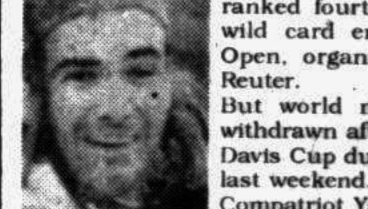
Andre Agassi will be the highest ranked player in the tournament behind world number two Boris Becker.

ROME, May 11: American Andre Agassi, ranked fourth in the world, has gained a wild card entry into next week's Italian Open, organisers said on Friday, reports Reuter.