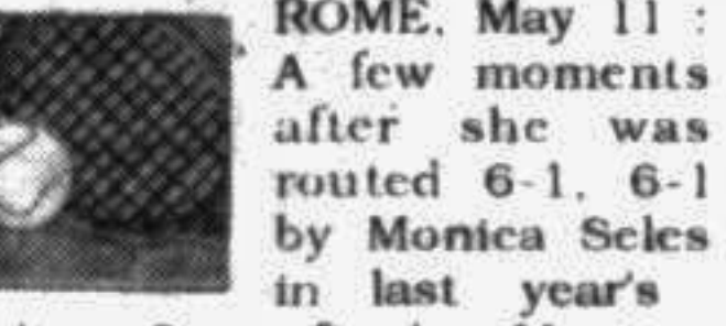
MARTINA NAVRATILOVA has more titles than the combined Italian Open field. Currently the world's fourth-ranked player behind Seles, Germany's Steffi Graf, and Sabatini, she is still the only real serve-and-volley player in women's tennis. And she is adored in Rome, even in a tournament that features Sabatini and US teenager Jennifer Capriati, both of whom are of Italian descent.