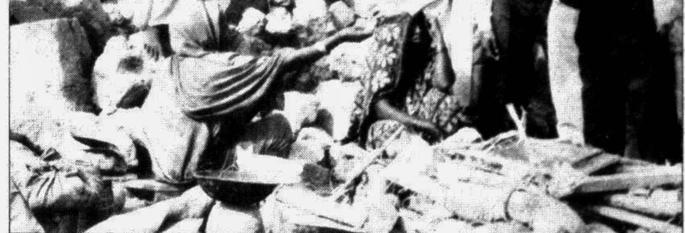
Acting Chairman of Jatiya Party Moudud Ahmed distributing relief materials among tornado victims at Gazipur on Wednesday.