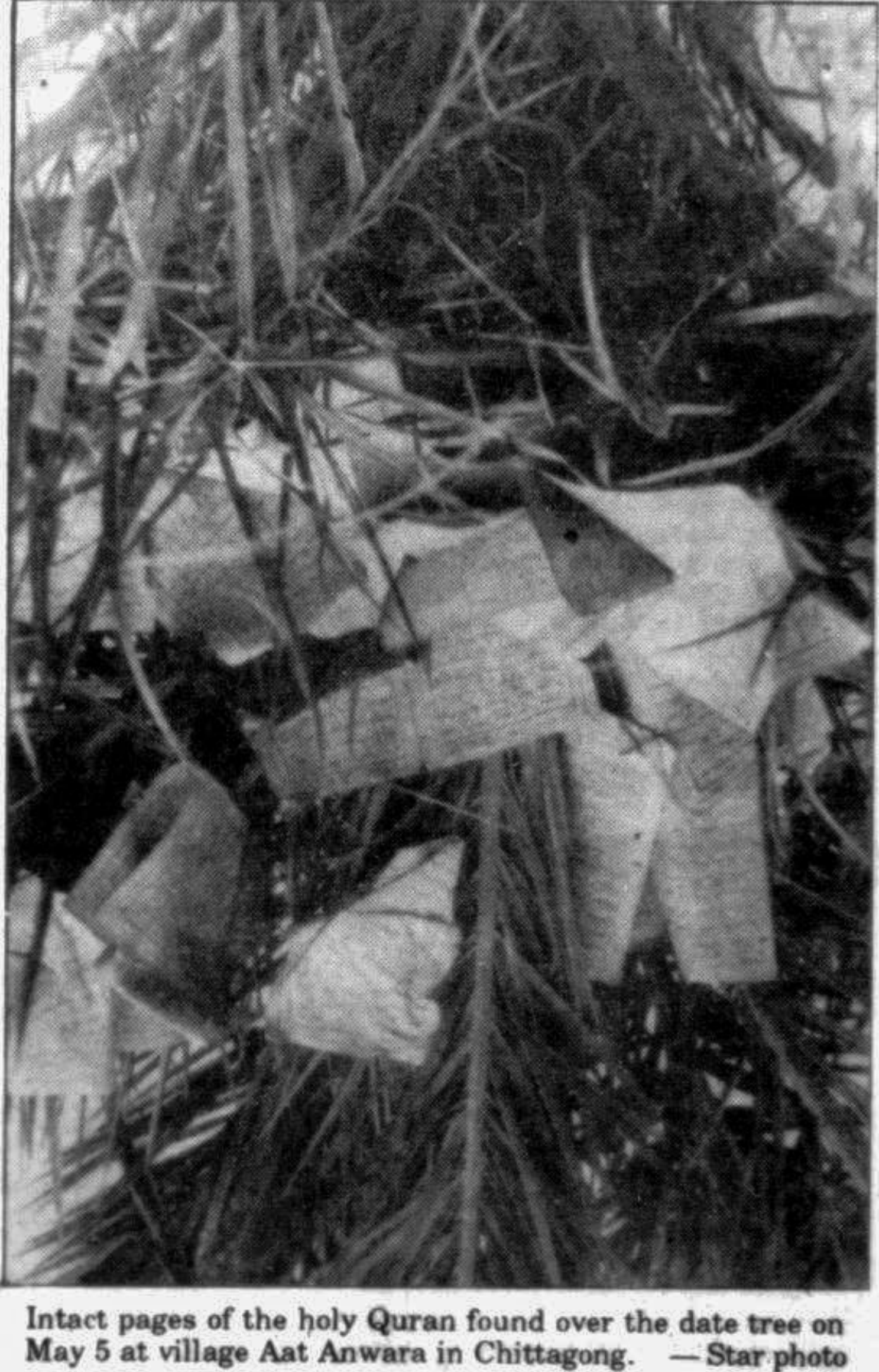
Intact pages of the holy Quran found over the date tree on May 5 at village Aat Anwara in Chittagong.

By Syed Isa BHOLA, May 8: The colossal damage caused by the cyclone of April 29 in Bhola district particularly in the offshore islands could be minimised by constructing more cyclone shelters in those areas. The official death figures rose to 219 in the chars within a week. Many more were feared to be added to this number. Only 68 cyclone shelters were constructed in the upazilas of Bhola, Daulatkhan, Char Fassion, Lalmojon, Tazumuddin, Borhanuddin and Monpura including offshore islands like Char Nizam, Dhalchar and Char Kukrimukri. Of the total cyclone shelters, six have already been eroded by the river Meghna and the rest are in a deplorable condition. The doors and windows of all the cyclone shelters I visited in those areas