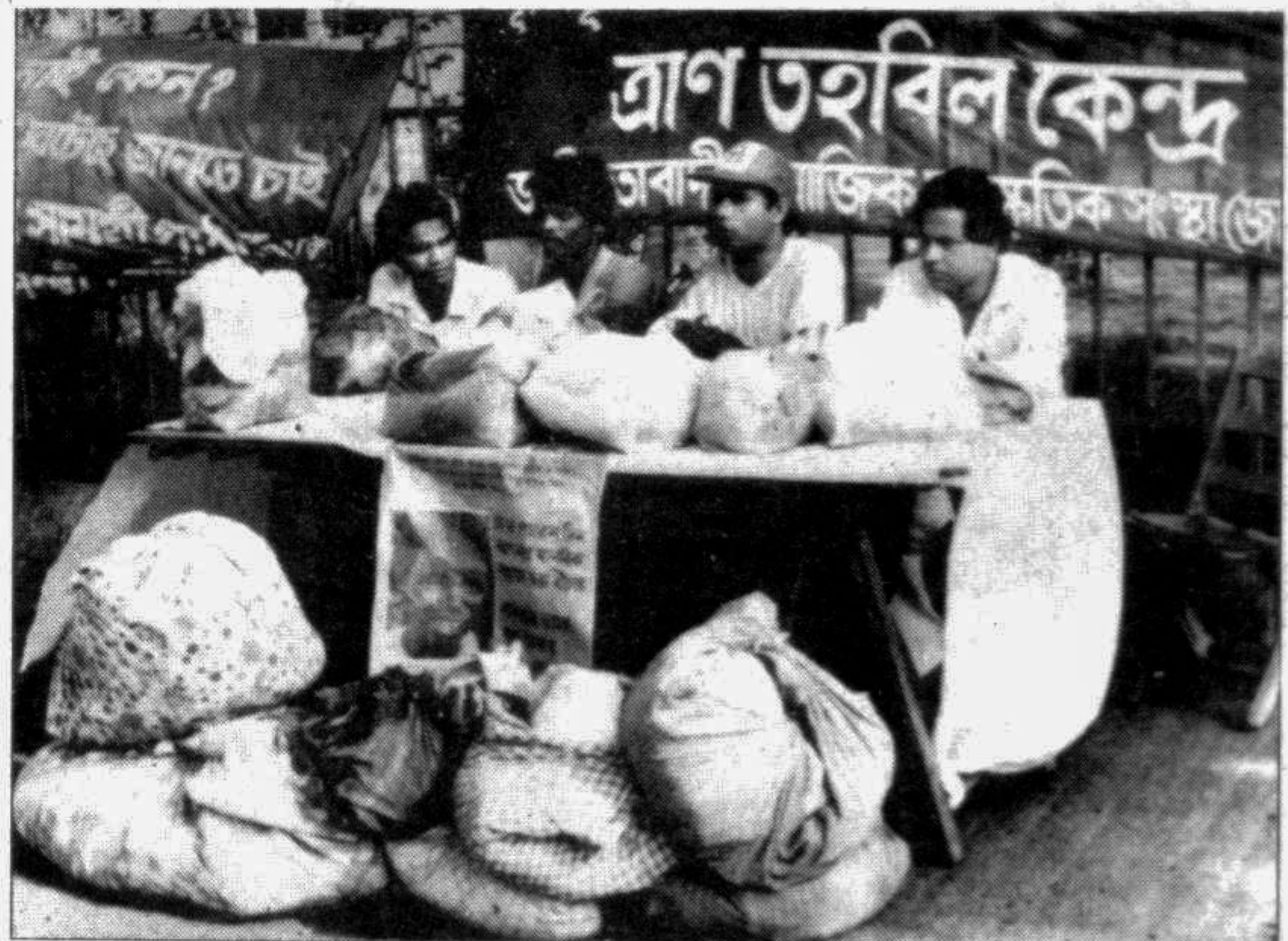
Jatiyatabadi Samajik Sangskritik Sangstha collecting relief goods in city.