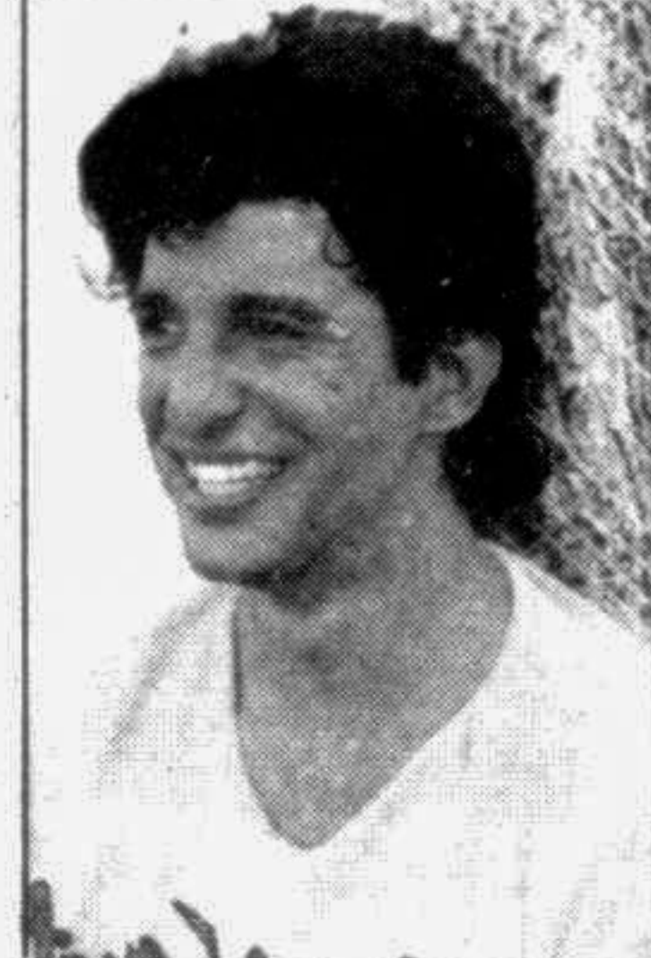
WASIM AKRAM...4 for 18