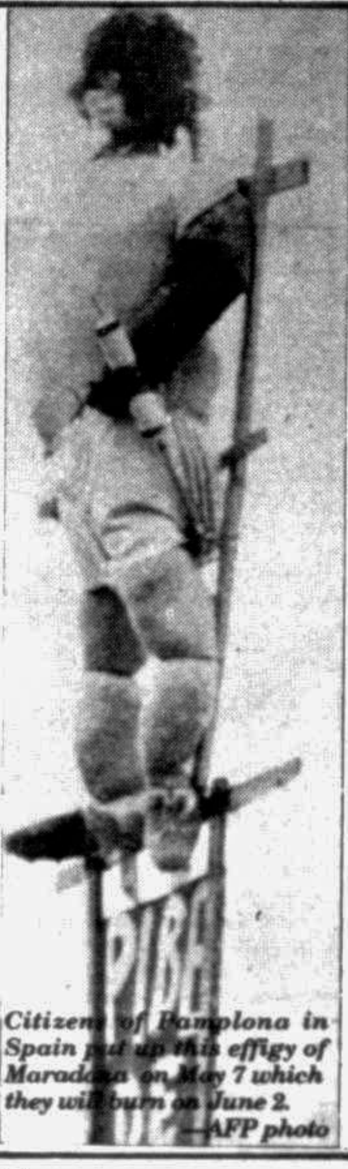
Citizen of Pamplona in Spain put up this effigy of Maradona on May 7 which they will burn on June 2.