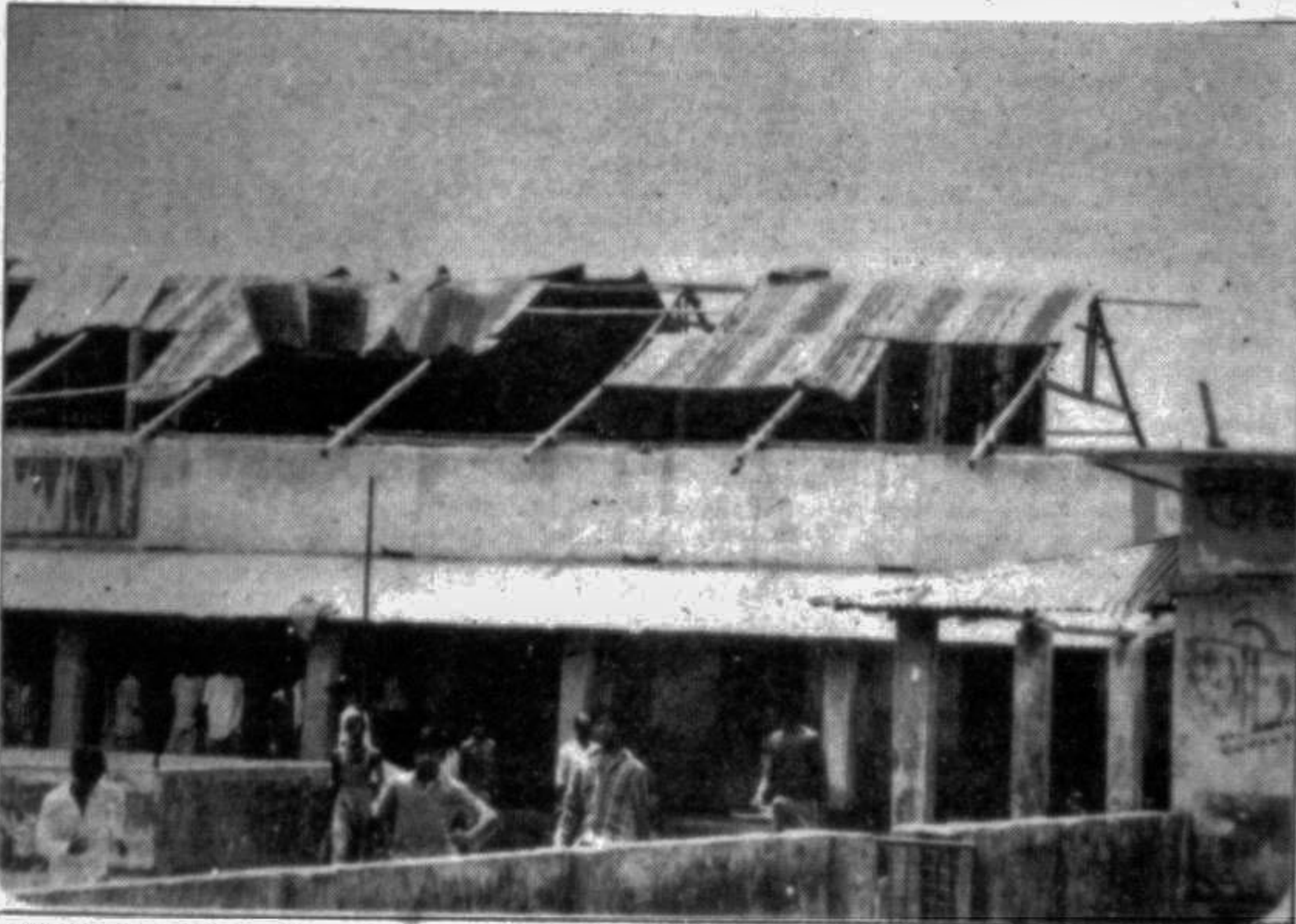
BARISAL: Waiting for relief materials in Daulatkhana upazila in Bhola district.

Telecommunication links between Bhola Sadar and other upazilas could not be restored fully.