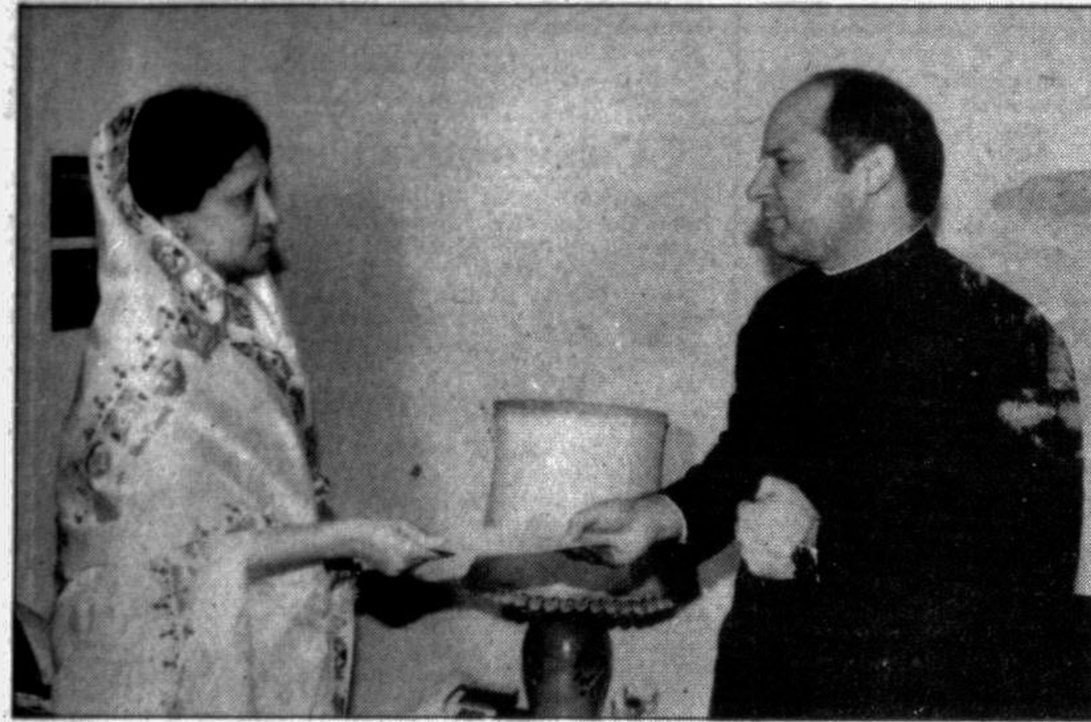
Pakistan Prime Minister Nawaz Sharif, who came to Bangladesh on Sunday, handing over a cheque to Prime Minister Khaleda Zia for the cause of the cyclone victims

Australia has provided 50,000 tonnes of wheat to Bangladesh over the past month under the bilateral development assistance programme.