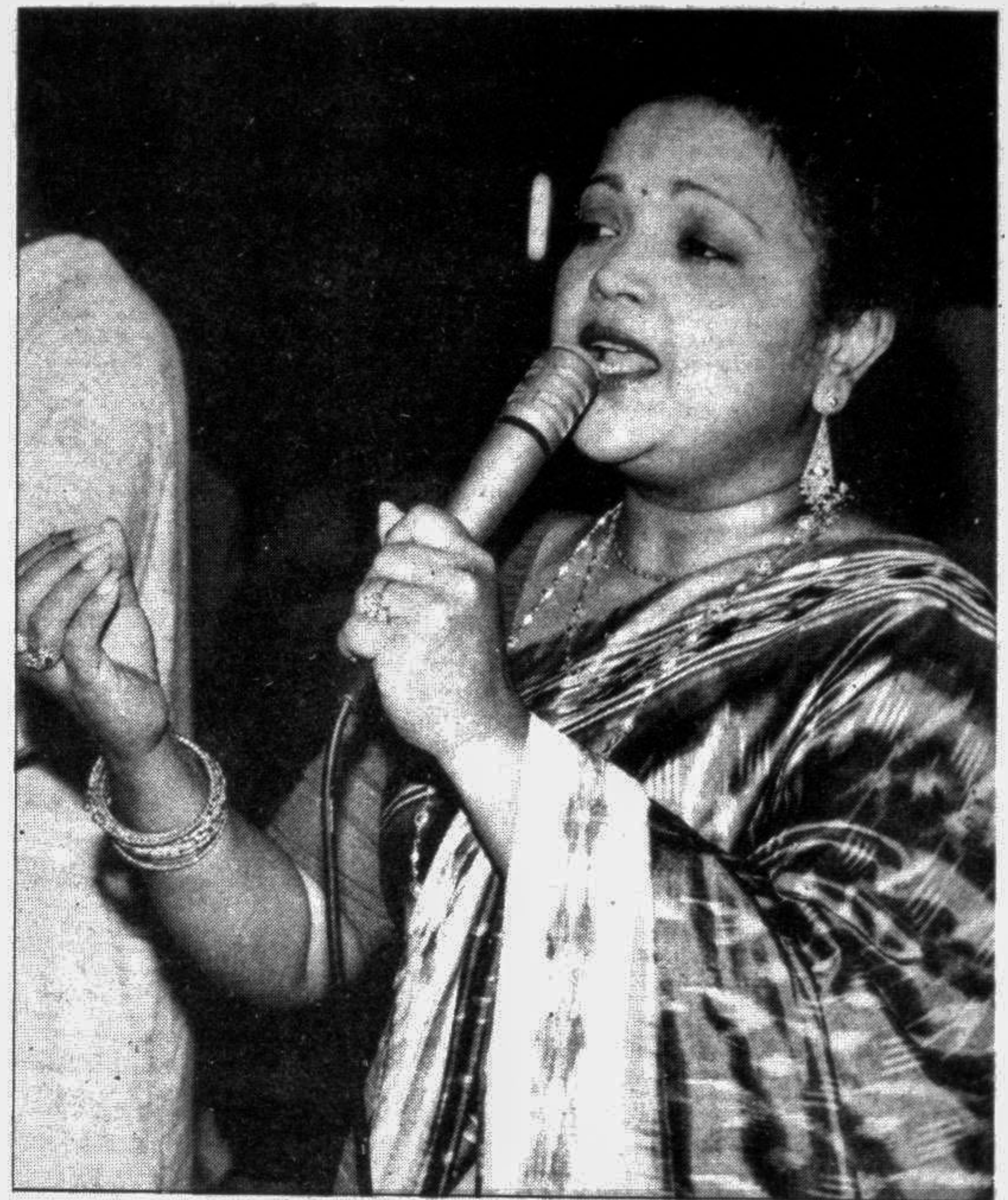
Noted singer Sabina Yasmin rendering songs at a cultural function of Bangla Academy, arranged on Monday to collect donations for cyclone victims

Managements of concerned industries have been requested to submit information about the extent of damage in terms of lakh Taka by separately showing damages caused to buildings, machinery, raw materials and finished goods, to the cell of division officer of the board.