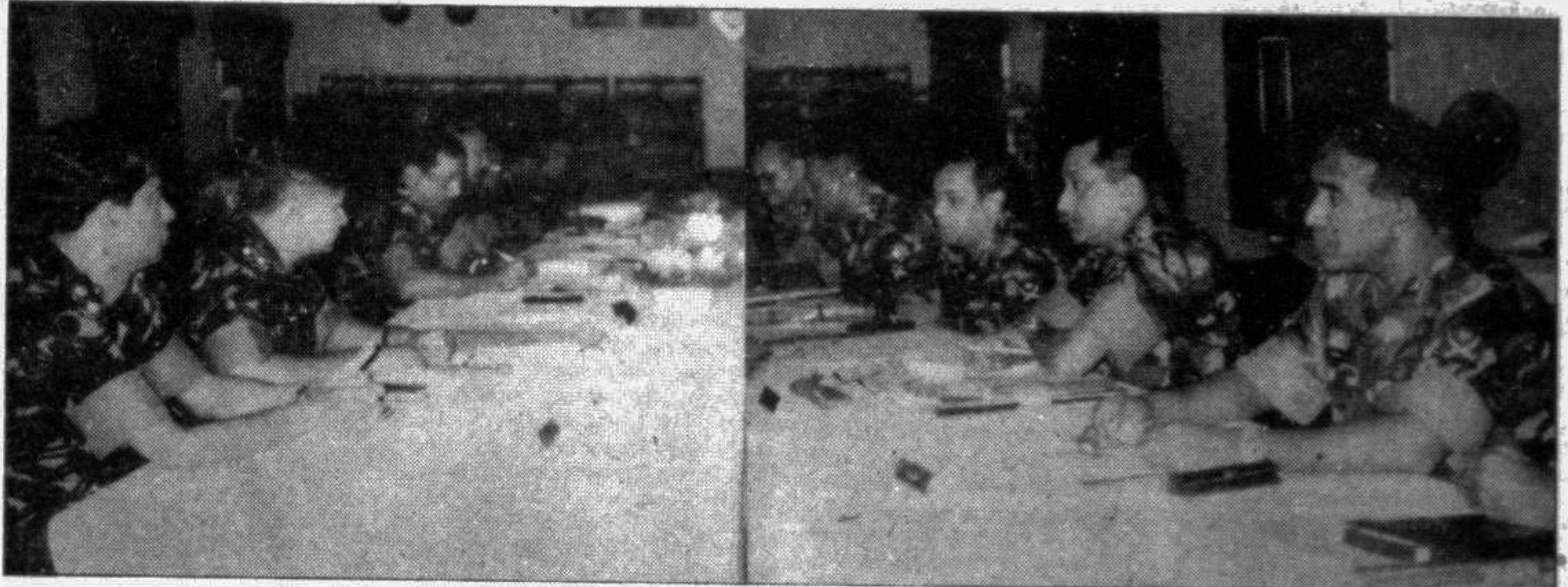
A relief co-ordination conference of the Formation Commanders was held at the Army Headquarters on Monday which was presided over by Chief of Army Staff Lt. General Muhammad Noor Uddin Khan.