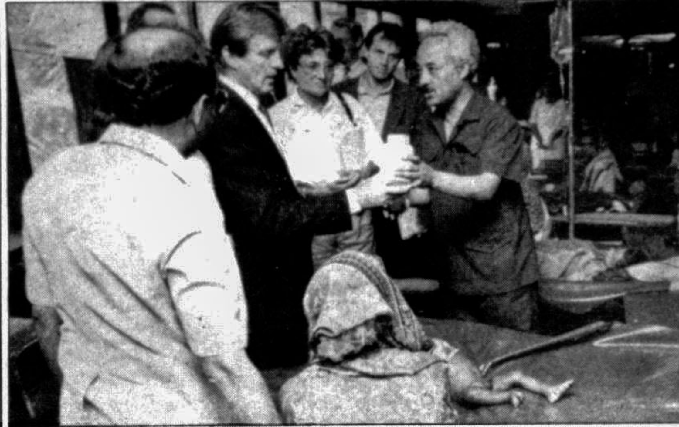
French Minister for Humanitarian Action Bernard Kouchner visiting the ICDDR,B Hospital on Monday.

Local people alleged that the quantum of relief goods is very negligible compared to the actual need in the affected areas.