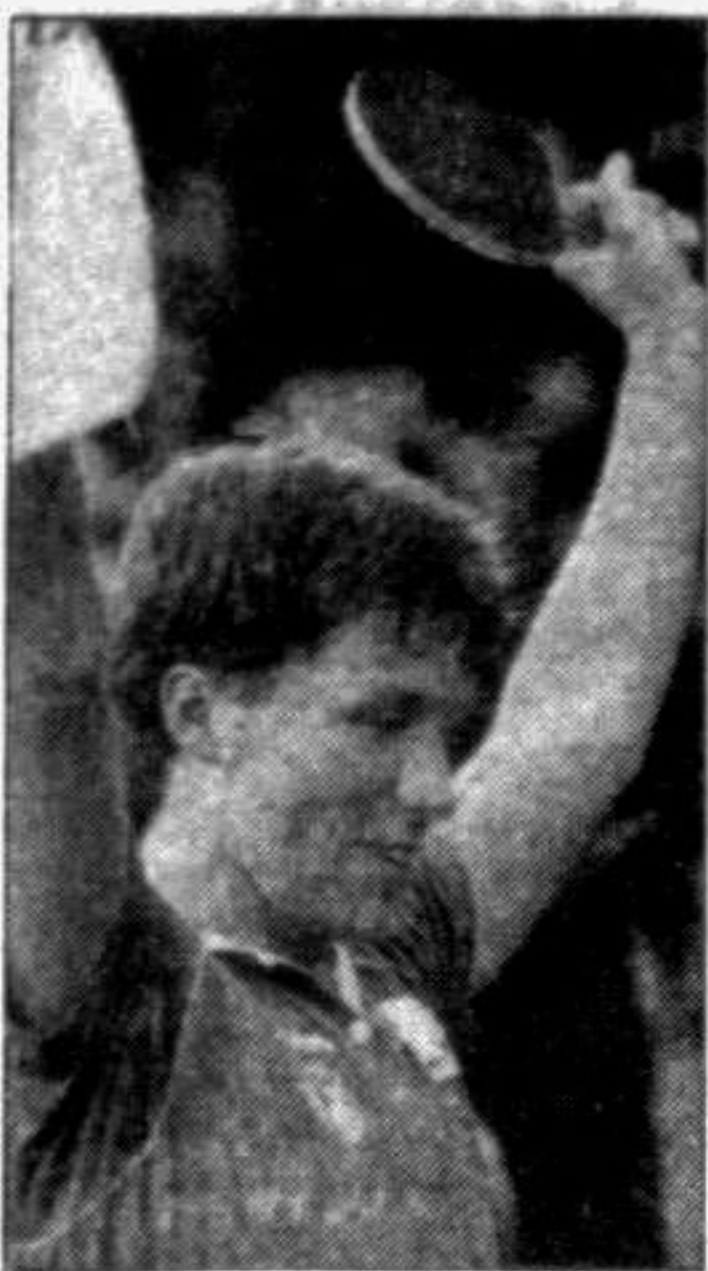
JAN-OVE WALDNER 21-19, 21-18, 21-11 defeated Soviet Dimitry Mazunov. Waldner, 25, appears on course for a repeat of his 1989 world championships final against fellow Swede Jeren Persson, seeded six. Persson won the deciding singles in a display of remarkable coolness under pressure

Jan-Ove Waldner, the world number one, moved effortlessly into the last 16 with a