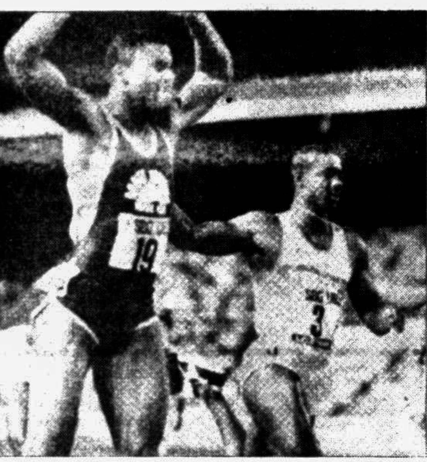
Carl Lewis (left) and Ben Johnson ended has been mediocre. Lewis was awarded the gold medal and credited with the world record for the time of 9.92 seconds he set in Seoul. A rematch between the two would be certain to involve large fees for both, men, who

Johnson Lewis in the Seoul Olympics but the Canadian then had his gold medal taken away and was stripped of the world record. His form on indoor tracks since his ban