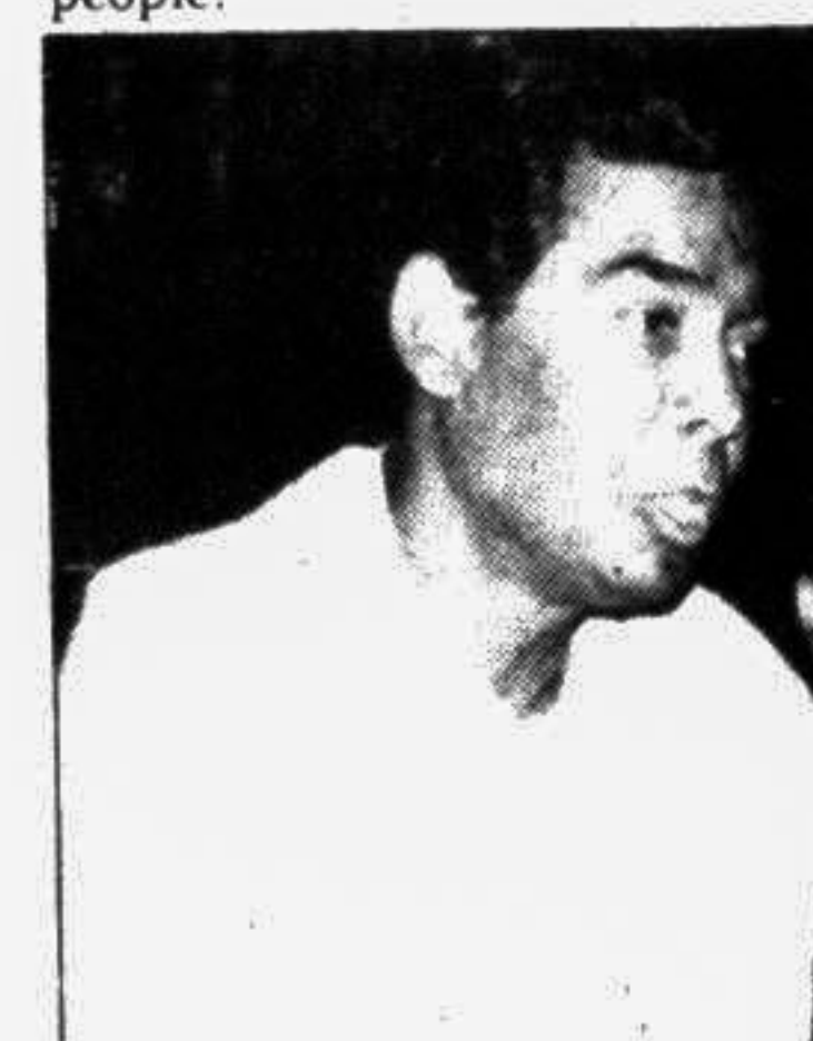
Rashed Khan Menon