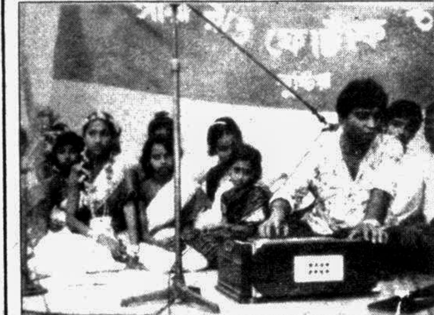
KUSHTIA: A view of a cultural function organised by Udichi Shilpi Gosthi, Kushtia branch, in observance of Pahela Baishakh at Public Library auditorium recently.

The Chamber expressed its deep shock at the loss of lives and damage to property by the severe cyclonic storm and expressed sympathy with the members of the bereaved families. It also prayed for the peace of the departed souls.