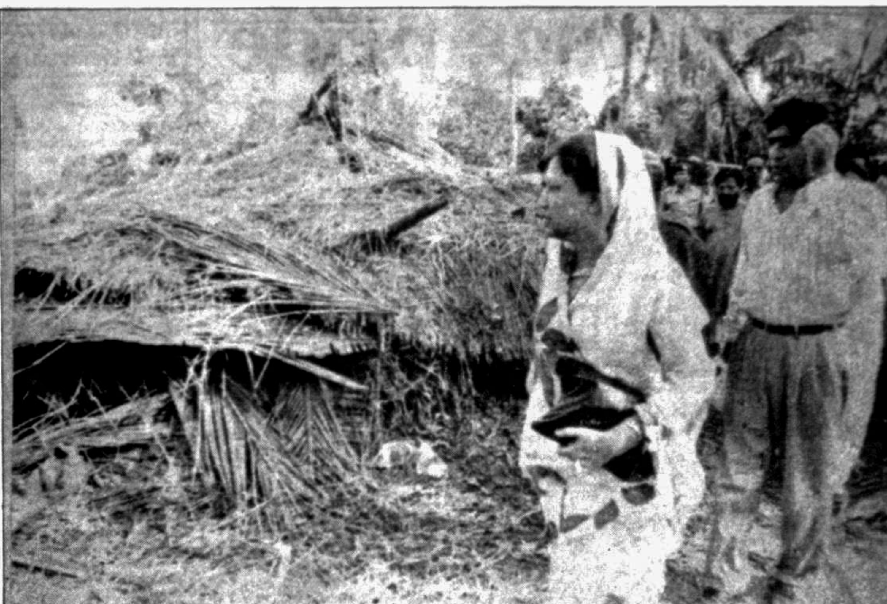
Prime Minister Begum Khaleda Zia visiting Kalatali village in Cox's Bazar devastated by cyclone on Wednesday.