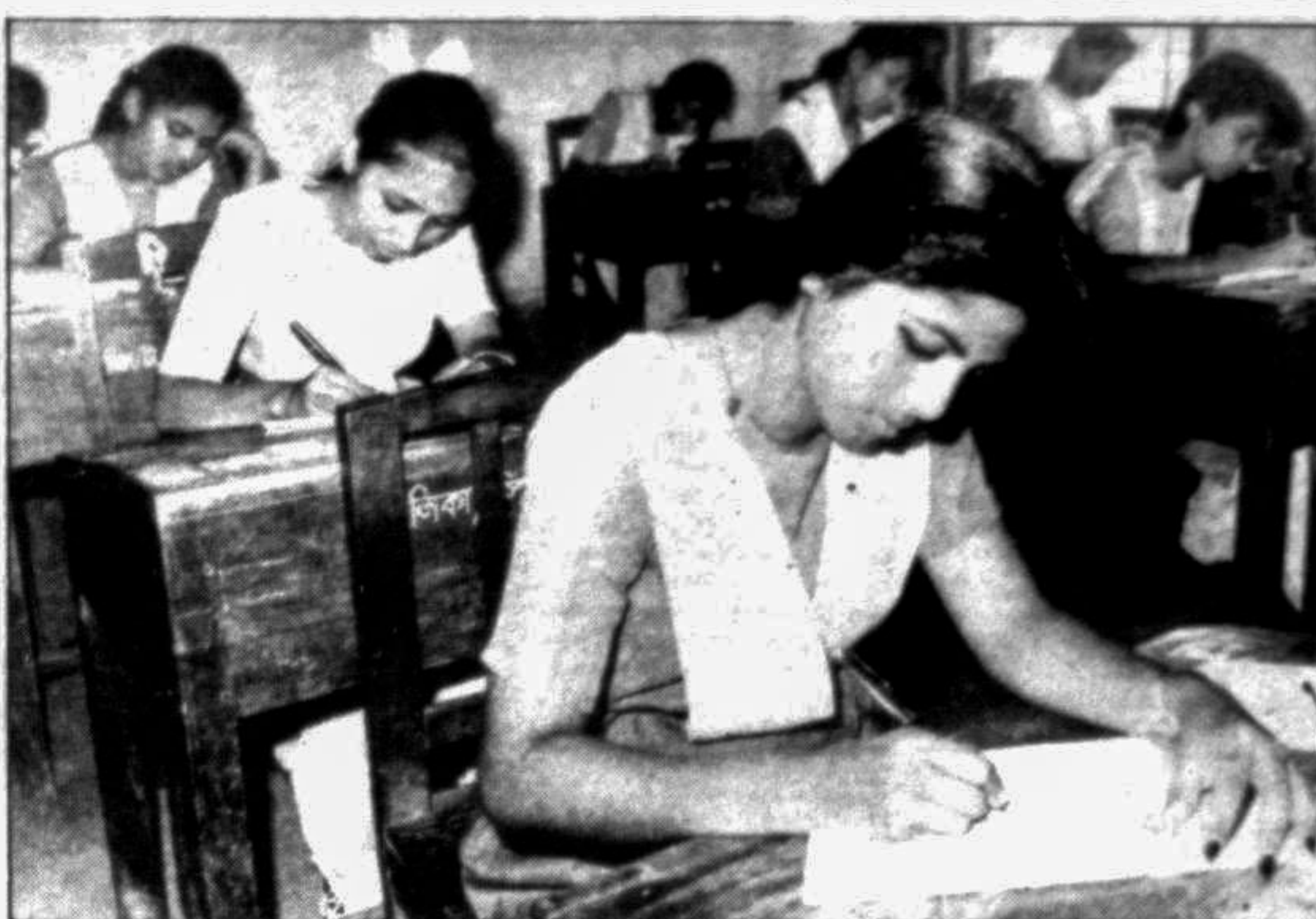
The Secondary School Certificate (SSC) Examinations under Dhaka Board began on Thursday. Candidates seen appearing in the examination at a city centre.

Temperatures and humidity of some cities and towns recorded on Thursday were: Towns/Cities Temperature in Celsius Humidity in percentage Dhaka 33.6 25.4 Sylhet 26.5 20.0 Comilla 32.0 24.0 Khulna 33.2 27.8 Rajshahi 37.7 27.2 Rangpur 31.6 22.5 Dinajpur 32.5 22.6 Barisal 31.6 27.0