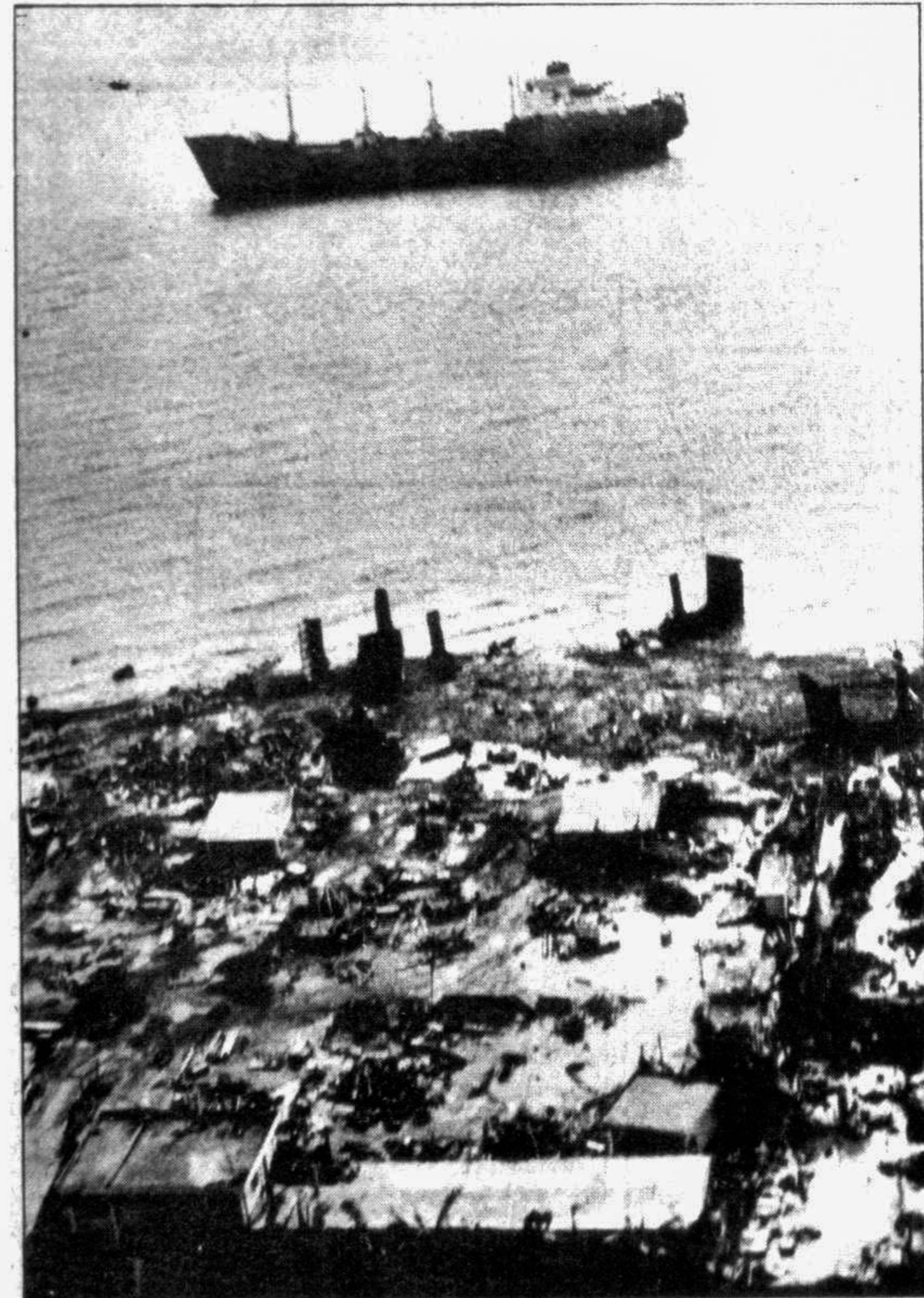
A ship, driven by the hurricane to Kumira from the sea, ran aground.