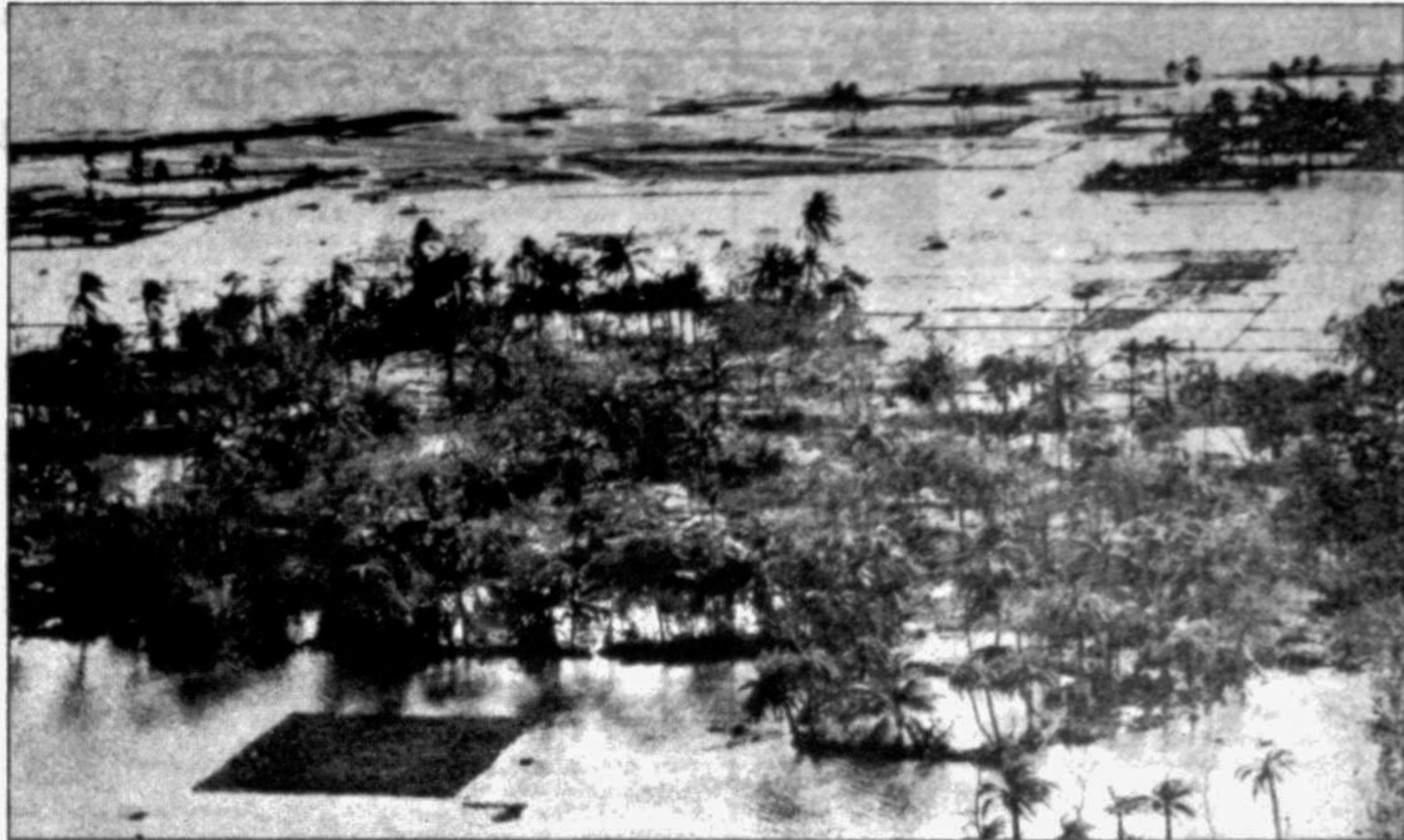
The otherwise busy human habitation at Fouzderhat now looks barren with houses and people all washed into the deep sea.