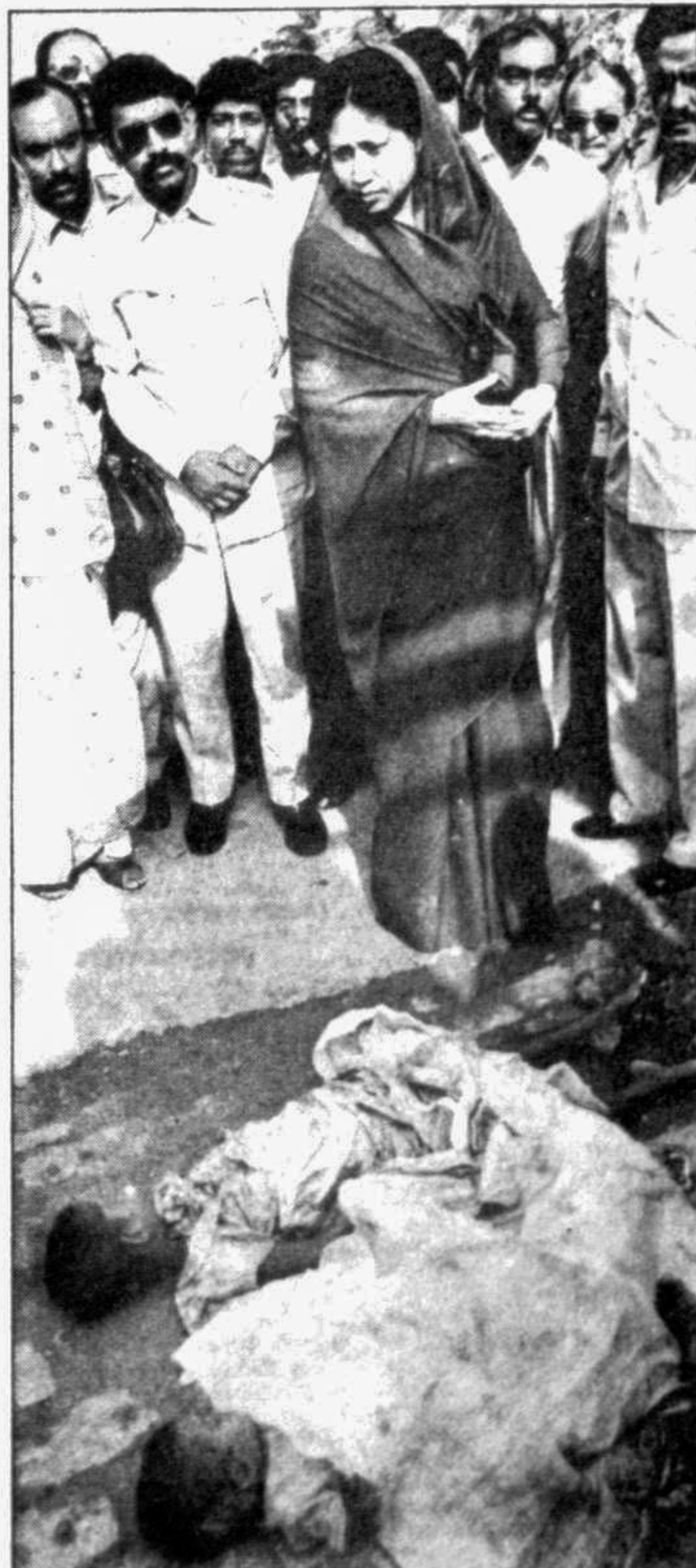
Prime Minister Khawaja Ziaur Rahman seen grief-stricken when she saw bodies of cyclone victims two babies.

The handout said the Family Directorate has asked its workers to contact with the head office if any one of them has been affected while working in the cyclone-hit areas.