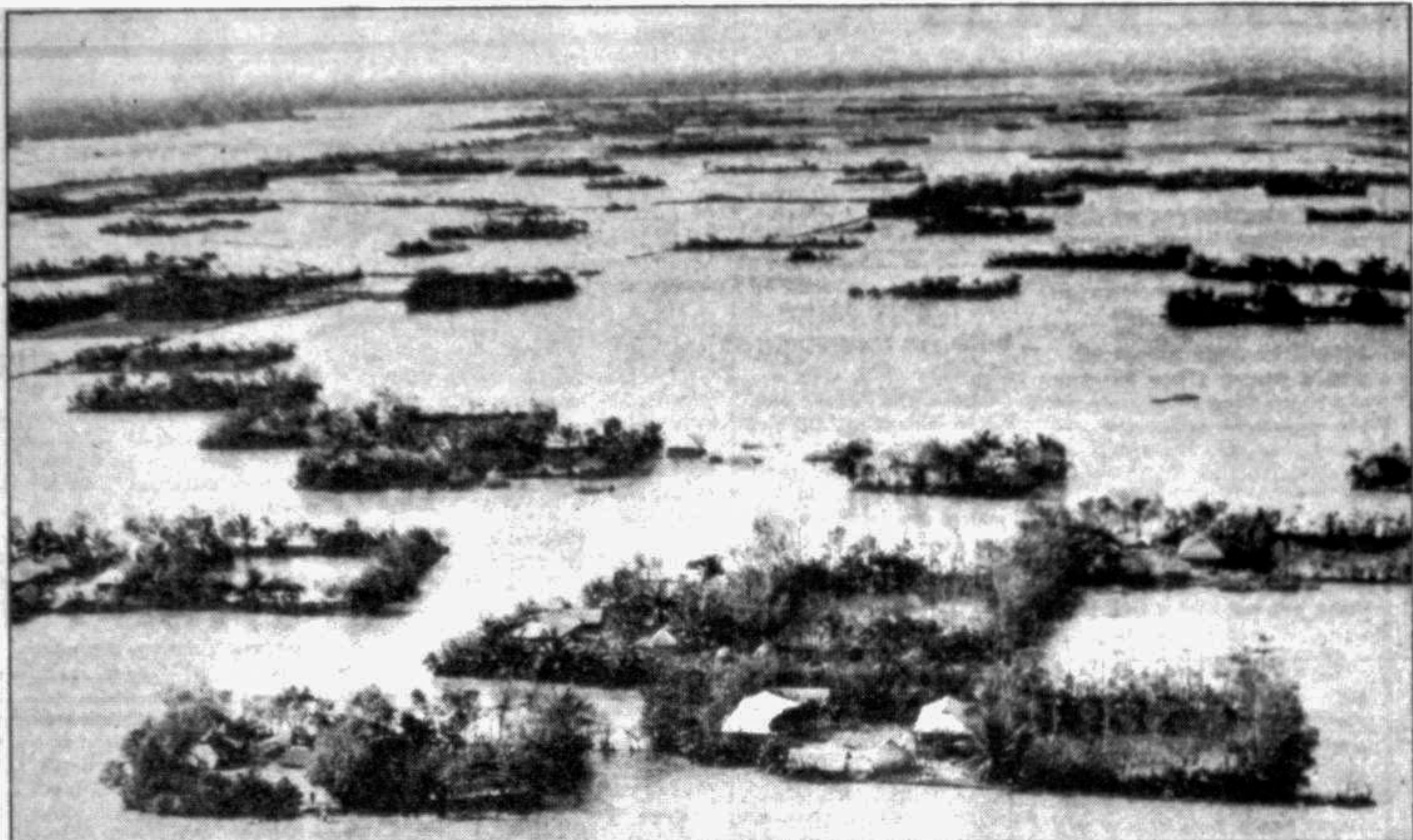
No, it wasn't a flash flood at Sitakund of Chittagong on Tuesday. The entire area is what the catastrophic cyclone Monday night left behind. None was there even to mourn the deaths.