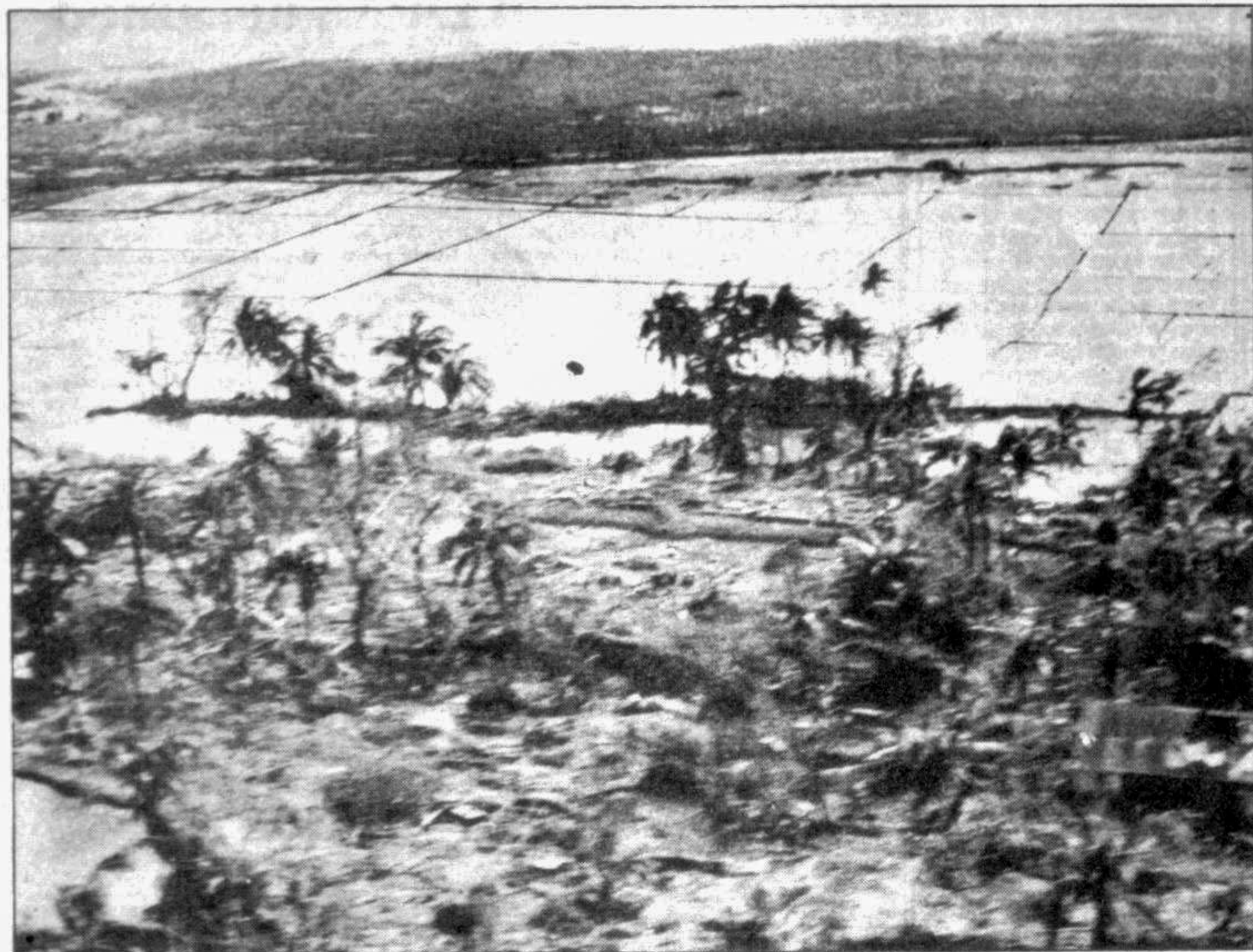
Once a thriving hamlet, Kumira was reduced to a no-man's land. It was lifeless on Tuesday.