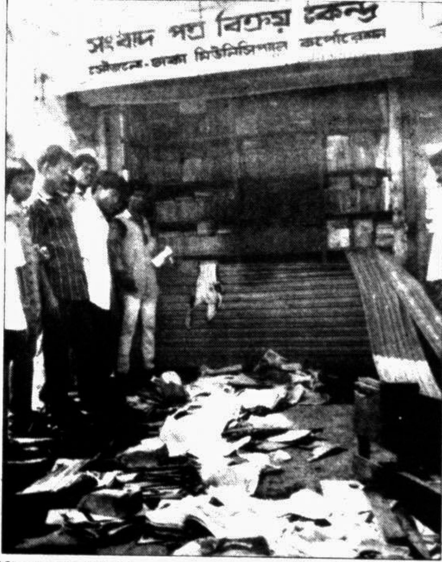
Miscreants set ablaze a newspaper stall at New Market in Dhaka on Tuesday following refusal of hawkers to pay illegal toll.

Minister for Education and Cultural Affairs Prof Badruddoza Chowdhury Tuesday visited the Orthopaedic Hospital to see for himself the conditions of those injured in a bus accident on Dhaka-Aricha highway Monday, reports UNB.