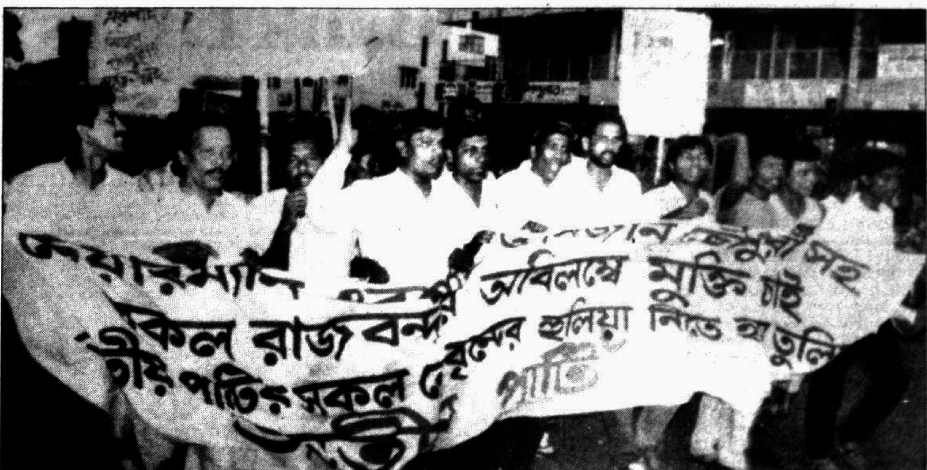
Jatiya Party organised a rally in city on Tuesday demanding release of HM Ershad and Mizanur Rahman Chowdhury.