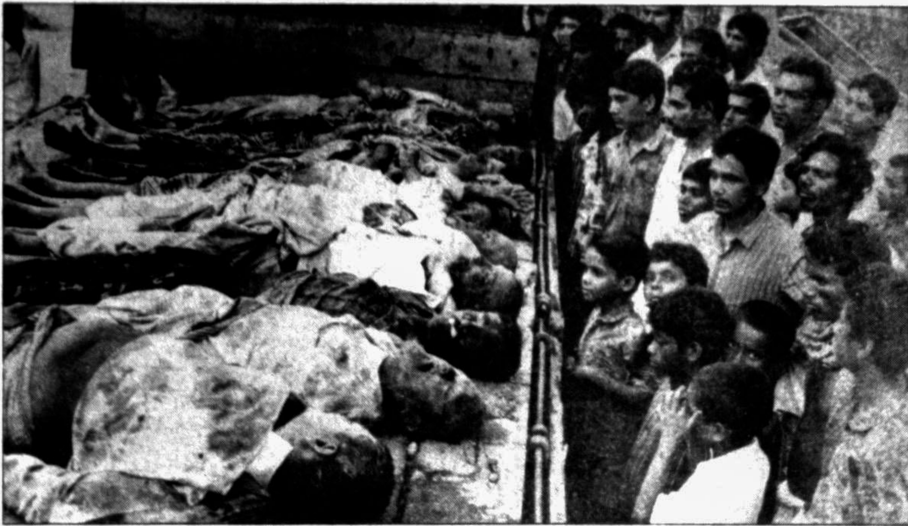
TRUCKLOAD OF BODIES: Some of the dead in Monday's bus accident on Dhaka-Aricha highway being removed from the spot.