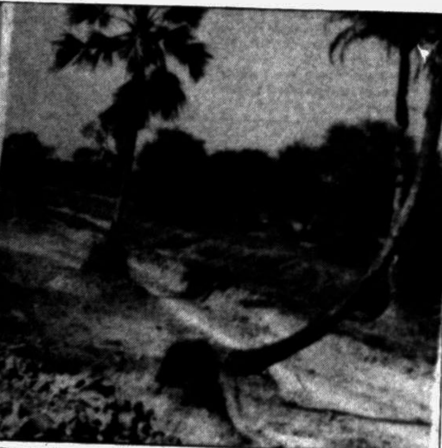
This is how earth has been removed from a road at Narail for use in brickfield by the unscrupulous owners.

Bhola Our Bhola Correspondent adds: A large number of plot of land in Bhola town belonging to Roads and Highways Department has been illegally occupied by a section of unscrupulous businessmen.