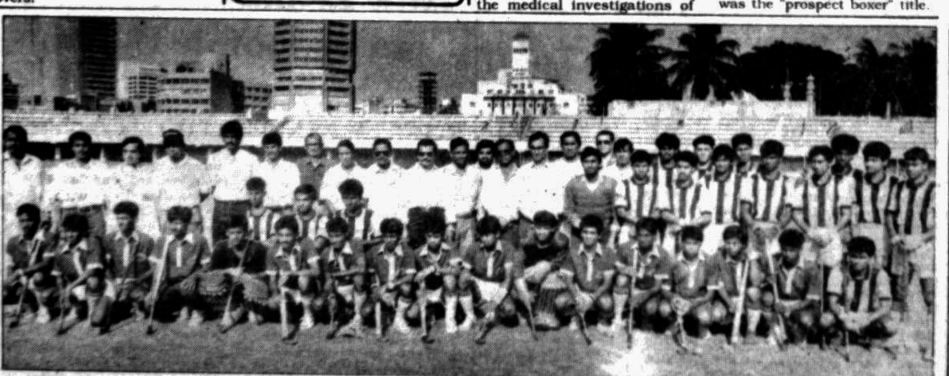
The two teams — Dhaka DSA and Faridpur DSA — is seen posing with State Minister for Youth and Sports Mirza Abbas.

"He's not thinking about one round," Mickelson said after posting a score that beat the two-time defender by three shots.