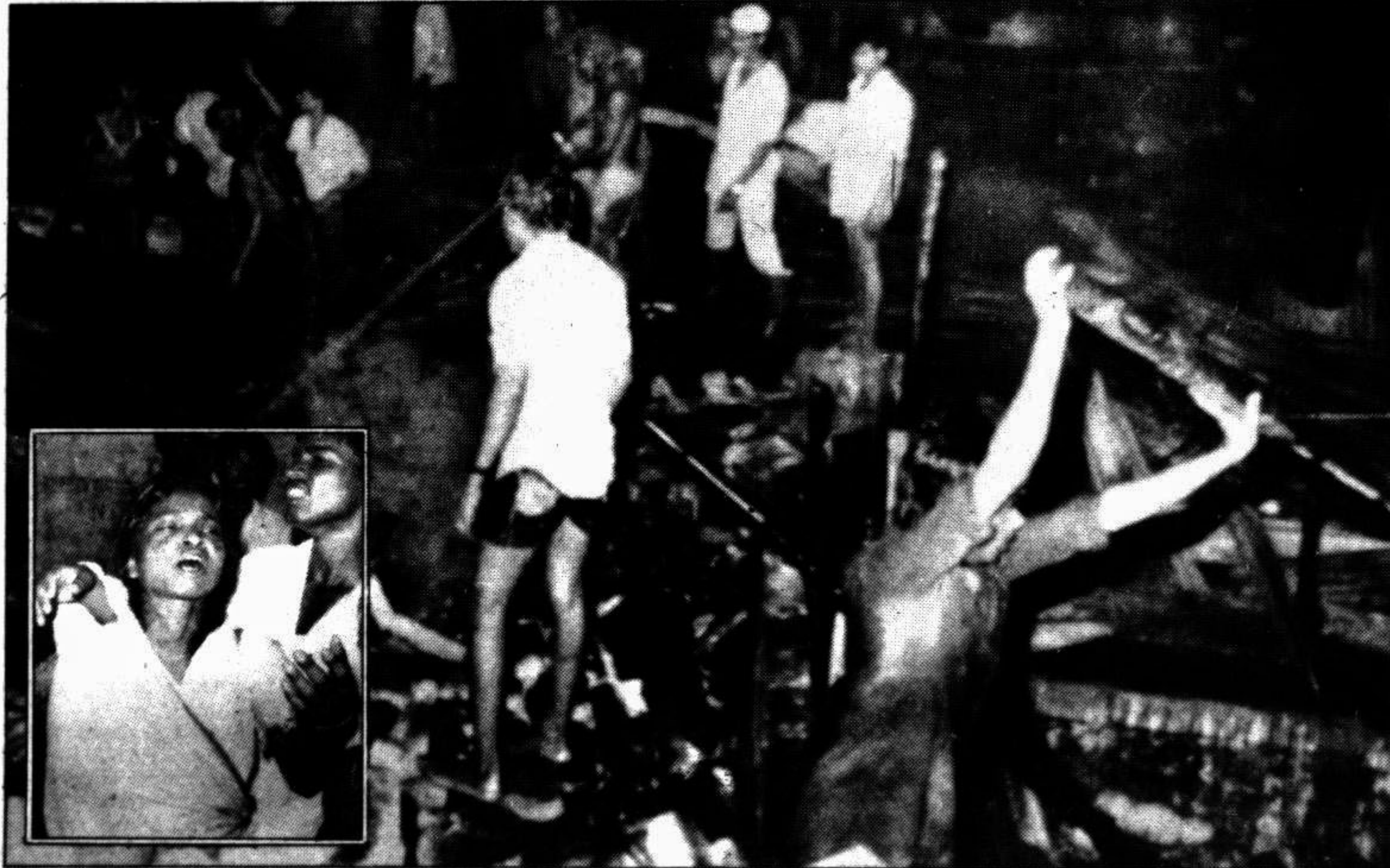
People retrieving charred household articles after a fire at a Paribag slum in the city last night. Inset — a wailing woman of the slum.