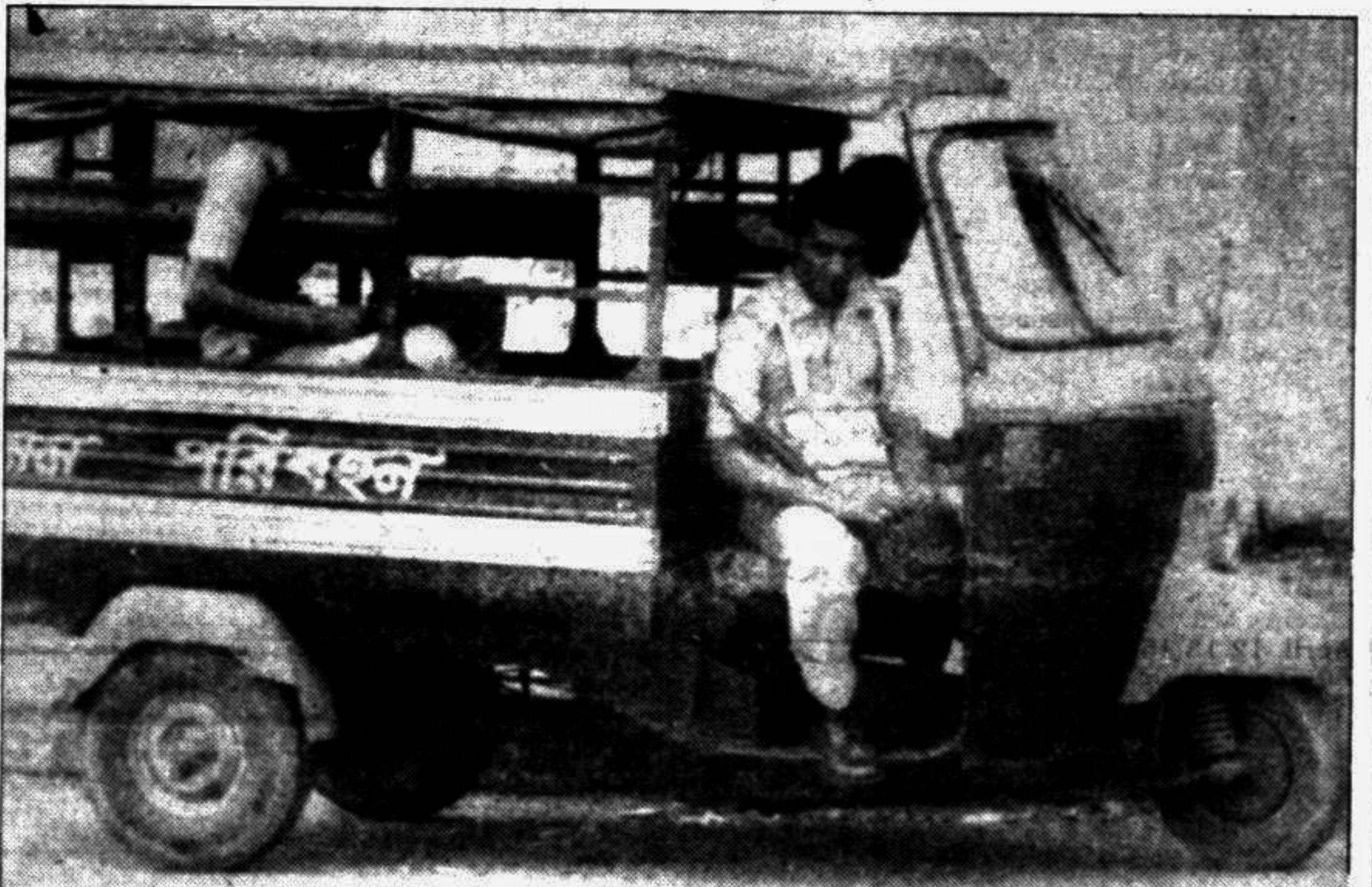
Police personnel having a ride in requisitioned auto-tempos in city.

Last year the government procured a number of transports for use by the police department. Smaller transports, if needed, can also easily be procured. Auto-tempo owners strongly feel that the concerned authority should take measures to stop such practice and protect the honest wage earners.